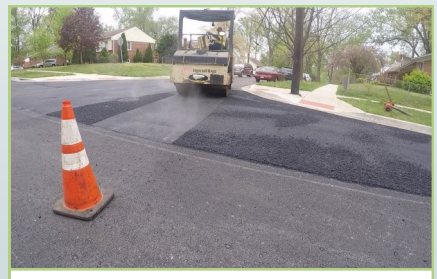
New asphalt is compacted with steel wheeled roller

6. Shoulder repair — After major construction operations have concluded, the contractor will repair any damage to the shoulders, including rutting and erosion.