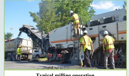
Typical milling operation

3. Pavement milling- Milling/grinding off the edges of the existing pavement allows the new pavement to match the level of the existing curbs, etc., and restores the proper highway cross-section to improve ride-ability and drainage. The new pavement will provide a smoother ride and assure positive drainage.