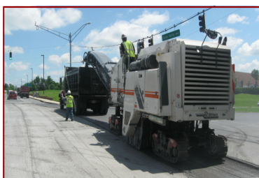
Typical milling operation.

2. Full Depth Patching - Full depth patching restores the pavement's structural integrity and capacity to support vehicle loads. The areas of distressed pavement marked by the MCDOT inspectors is removed and replaced by new asphalt pavement. The final paving of the road will cover these patched areas.