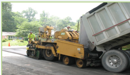
Typical hot mix asphalt paving operation

4. Paving with hot mix asphalt - Asphalt is delivered to the site in dump trucks. The hot material is transferred into the hopper of an asphalt paving machine such as the one depicted in the photo. The paving machine places the hot asphalt in a uniform thickness and compaction.