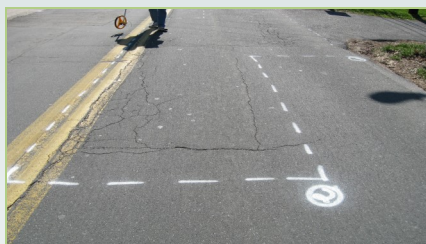
Typical survey paint markings

The last survey was completed in 2017. At that time, MCDOT concluded a complete condition inventory of all County roads, identifying and rating the condition of each. This new assessment survey, updated every two years, has enabled the development of County-wide roadway repair strategies based on a formula-based objective rating system.