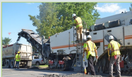
Typical milling operation

3. Pavement milling - Milling/grinding off the edges of the existing pavement allows the new pavement to match the level of the existing curbs, etc., and restores the proper highway cross-section to improve ride-ability and drainage. The new pavement will provide a smoother ride and assure positive drainage.