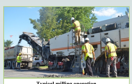
Typical milling operation

4. Paving with hot mix asphalt - Asphalt is delivered to the site in dump trucks. The hot material is transferred into the hopper of an asphalt paving machine such as the one depicted in the photo. The paving machine places the hot asphalt in a uniform thickness and compaction.