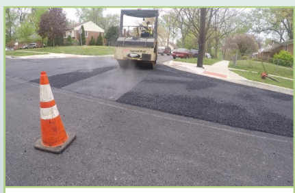
New asphalt is compacted with steel wheeled roller

6. Shoulder repair — After major construction operations have concluded, the contractor will repair any damage to the shoulders, including rutting and erosion.