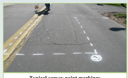
Typical survey paint markings

The last survey was completed in 2017. At that time, MCDOT concluded a complete condition inventory of all County roads, identifying and rating the condition of each. This new assessment survey, updated every two years, has enabled the development of County-wide roadway repair strategies based on a formula-based objective rating system