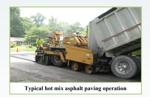
5. Replace roadway lane markings - Permanent lane markings, if existing prior to paving, will be remarked shortly after all paving operations have been completed.

4. Paving with hot mix asphalt - Asphalt is delivered to the site in dump trucks. The hot material is transferred into the hopper of an asphalt paving machine such as the one depicted in the photo. The paving machine places the hot asphalt in a uniform thickness and compaction.