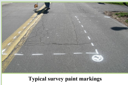
Typical survey paint markings

Generally, the work will proceed as follows: