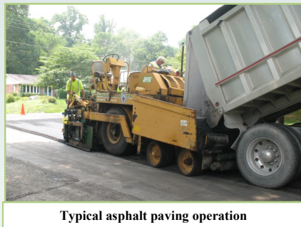
Typical asphalt paving operation

7. Replace roadway lane markings - Permanent lane markings will be replaced shortly after paving operations.