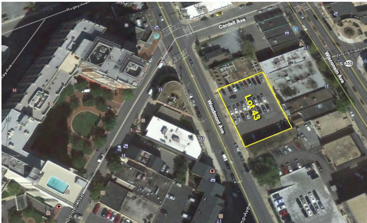
Lot 43 Site

Lot 43 is located at 8009 Woodmont Avenue in Bethesda and is approximately 12,500 square in size. The parcel is made up of Lots 487 through 491, in a subdivision known as “Woodmont” recorded as Plat Book 1, Plat No. 4, recorded among the Land Records of Montgomery County, Maryland and being more particularly described as follows in Maryland State Plane Datum (NAD83). The property is on the east side of Woodmont Avenue between St. Elmo and Cordell Avenues in the Woodmont Triangle section of the Bethesda Central Business District of Montgomery County, Maryland. The Woodmont Triangle is known for its eclectic mix of dozens of restaurants serving ethnic and international cuisines, as well as small retail shops and boutiques, and office and higher density residential buildings.