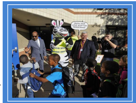
Walk to School Day 2017 at Ronald McNair Elementary School