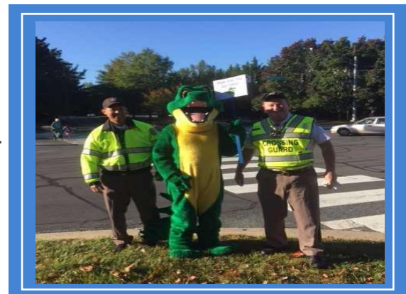
A Walk to School Day contest entry from William Gibbs Elementary School!