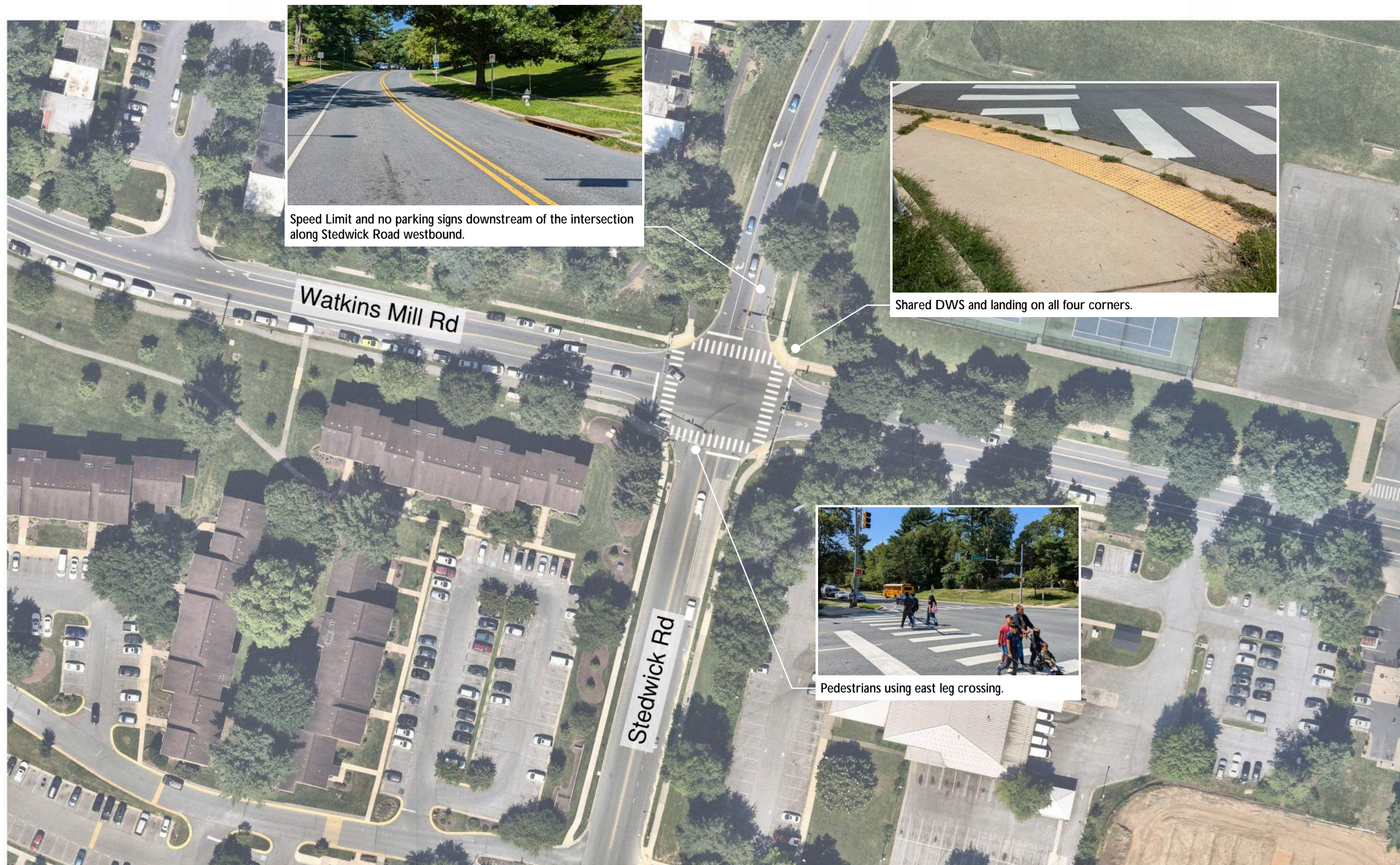
Figure 1 - Watkins Mill Road Corridor Observations