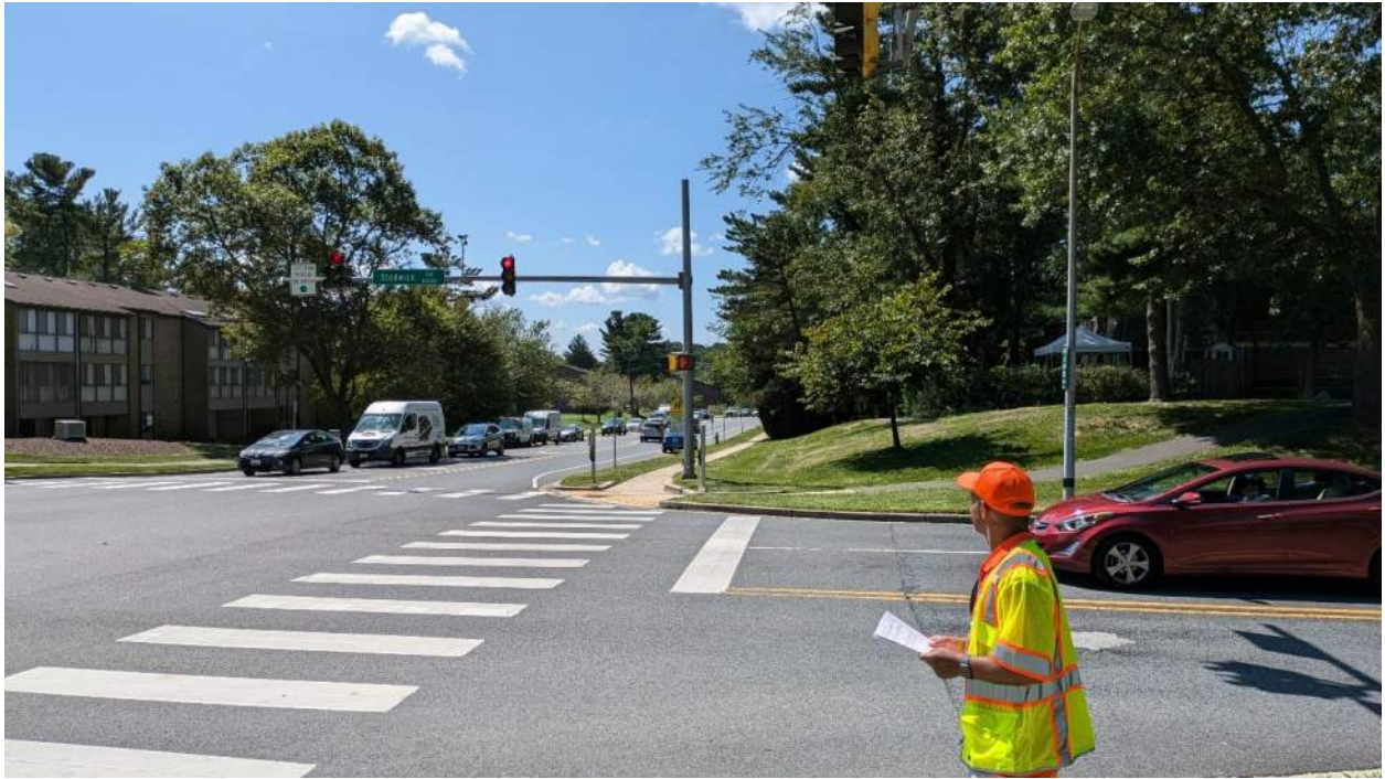
Photo 1. West leg of intersection where crash occurred, looking east along Stedwick Road.