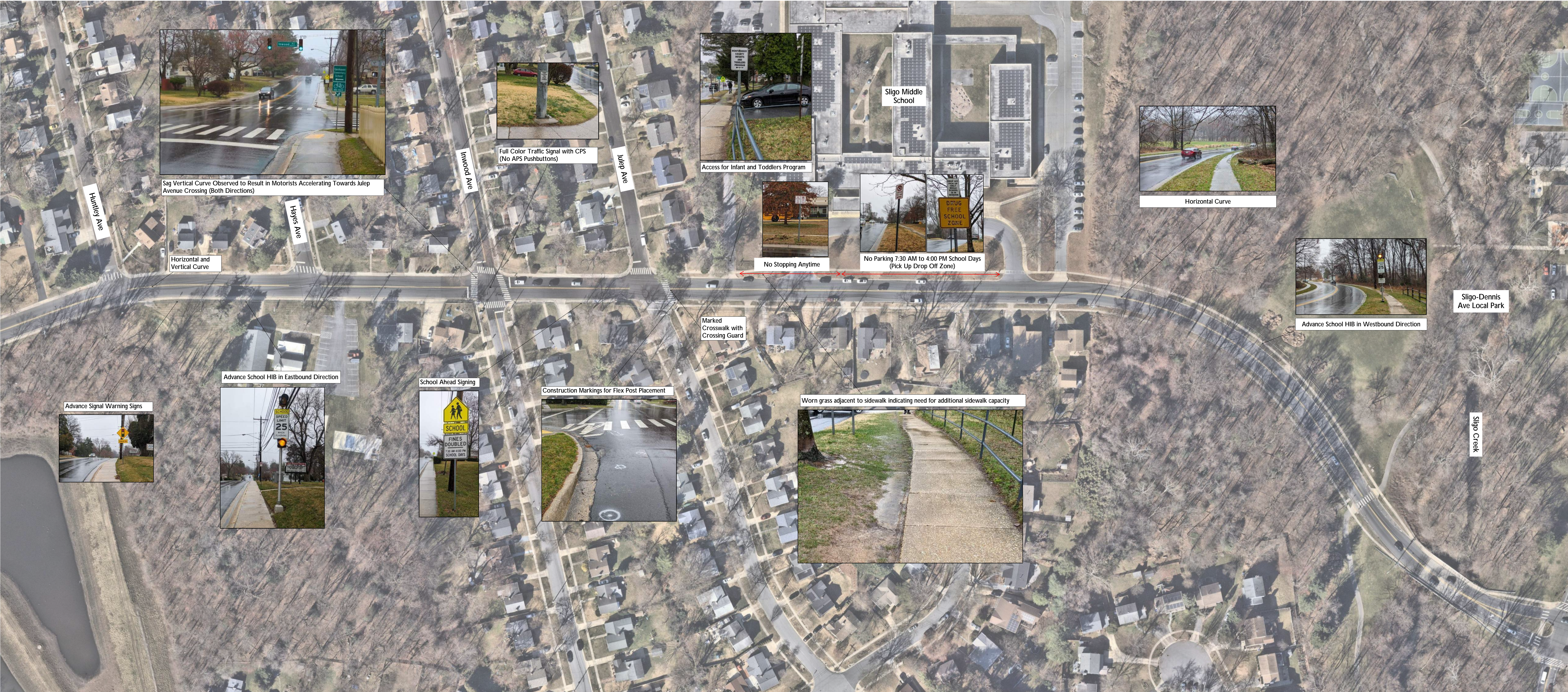
FIGURE 1 - DENNIS AVENUE CORRIDOR EVALUATION