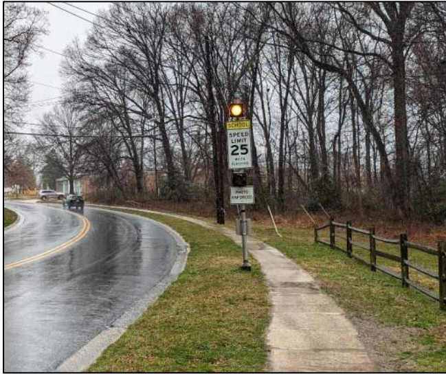
Photo 2. School Zone HIB