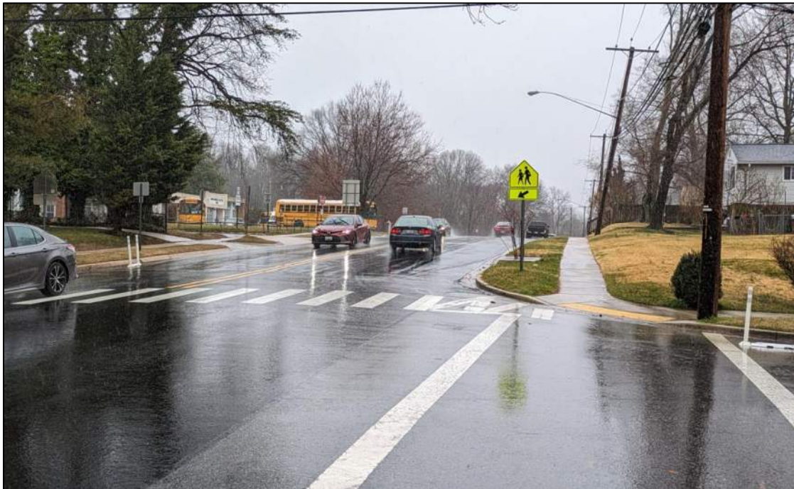
Photo 1. Crosswalk Markings at Julep Ave