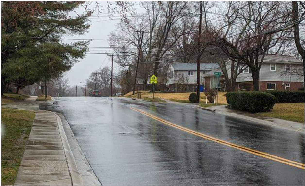
Photo 5. Eastbound Approach to School Crossing