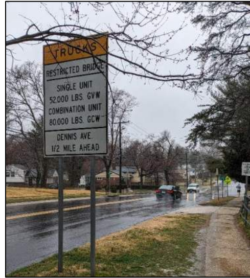
Photo 3. Bridge Truck Restriction