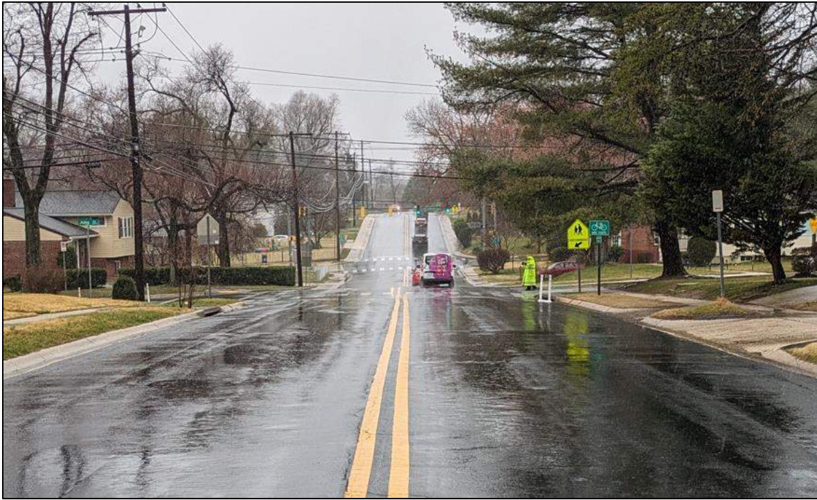
Photo 4. Westbound Approach to School Crossing