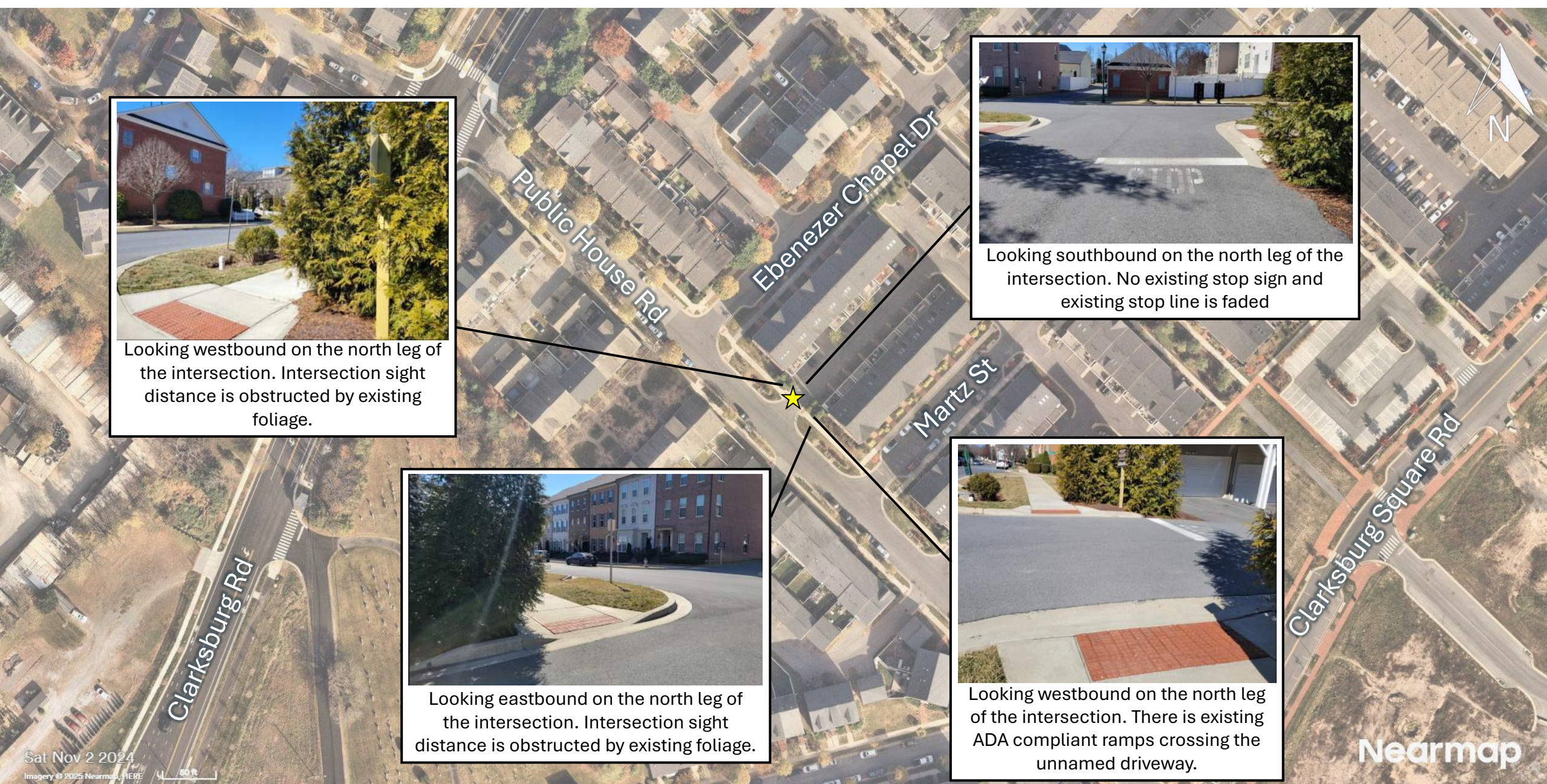
Figure 1 – Public House Rd between Ebenezer Chapel Dr and Martz Street Observations