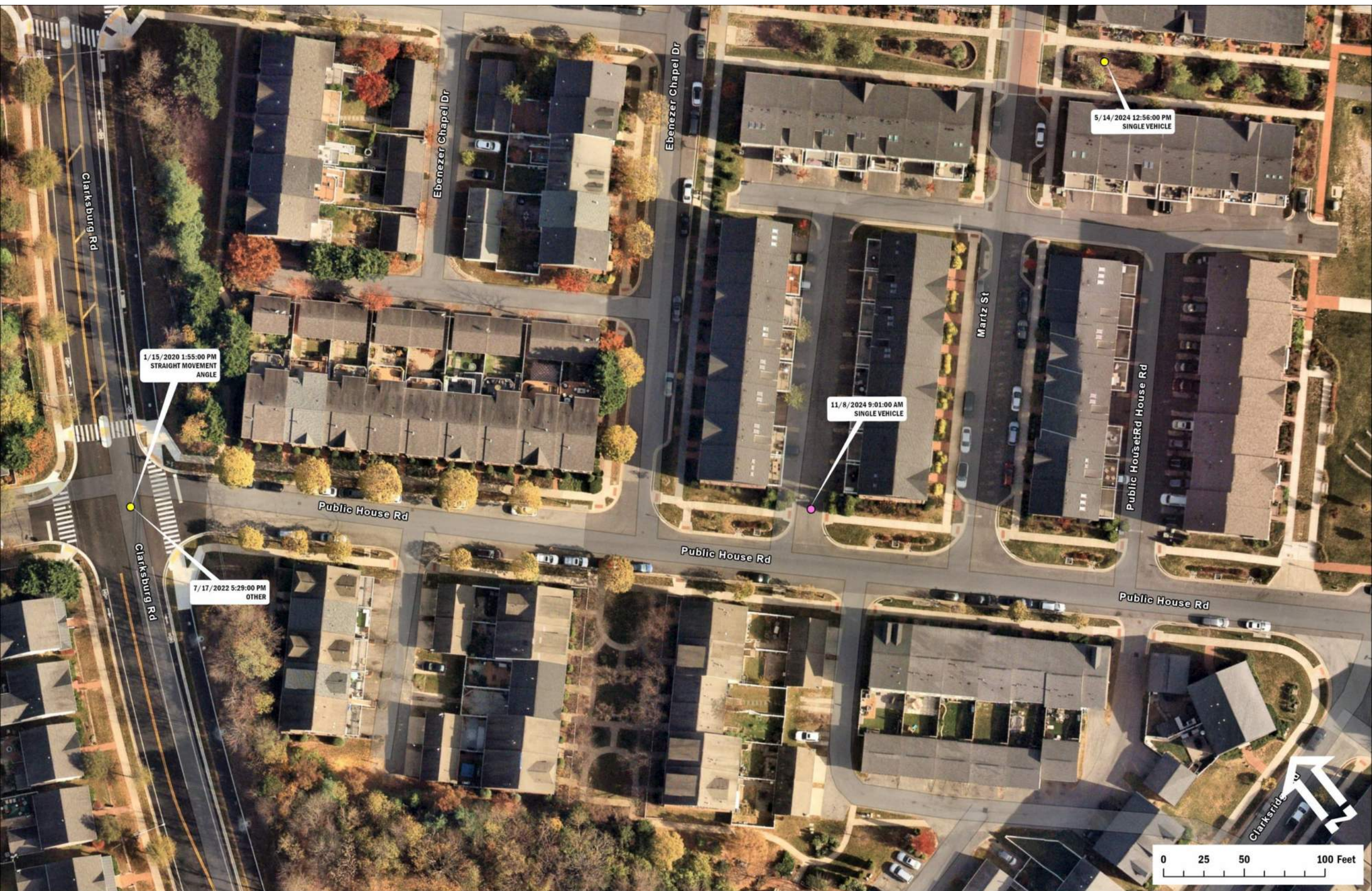
Figure 3 – Crash History (2020-2024)