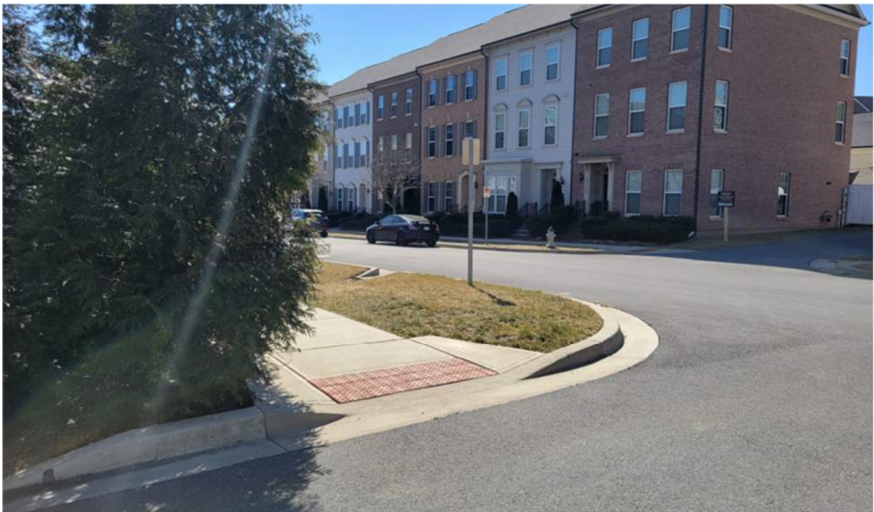
Photo 2. Taken from the southbound approach looking eastbound along Public House Road.