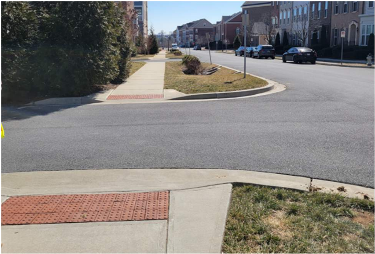
Photo 1. Taken from northwest corner looking eastbound along Public House Road at the north leg crossing. Approximate crash location.