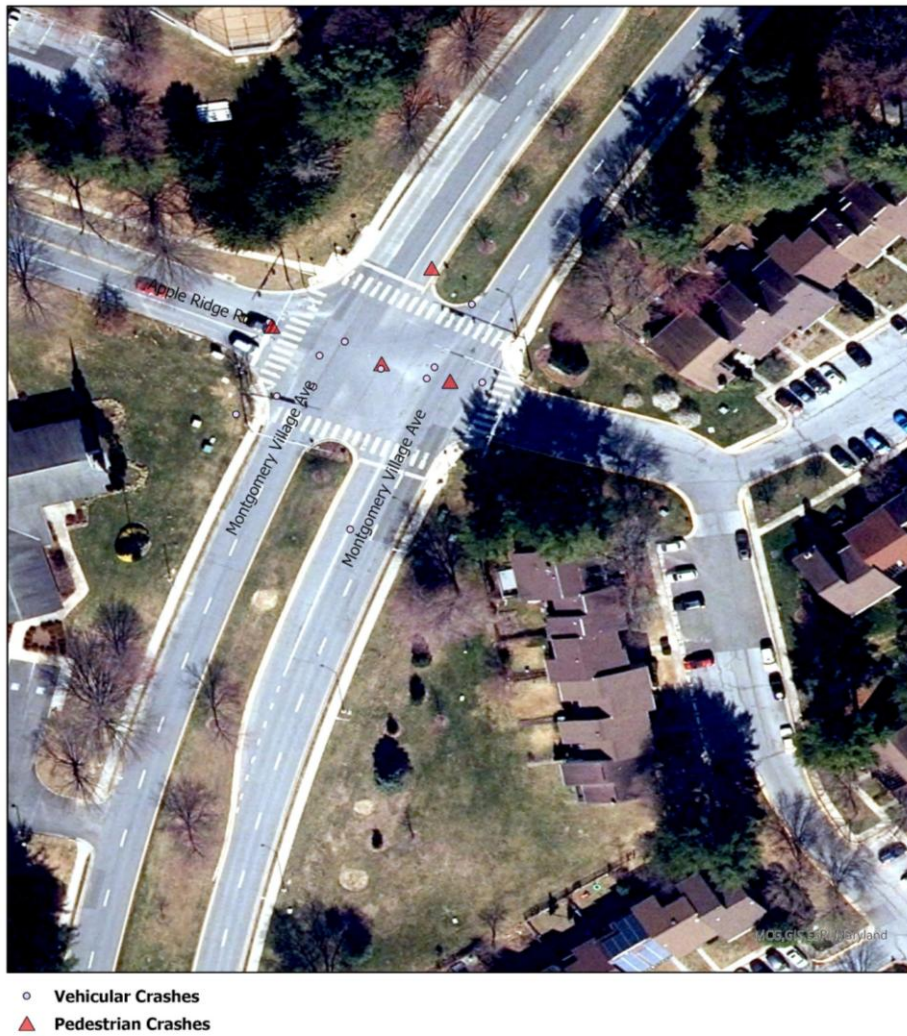
Figure 2: Crash Location Map