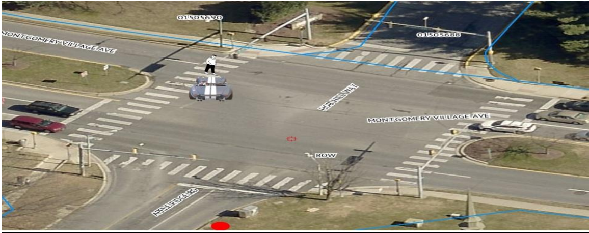
Figure 1: Crash location and direction of pedestrian and vehicle travel