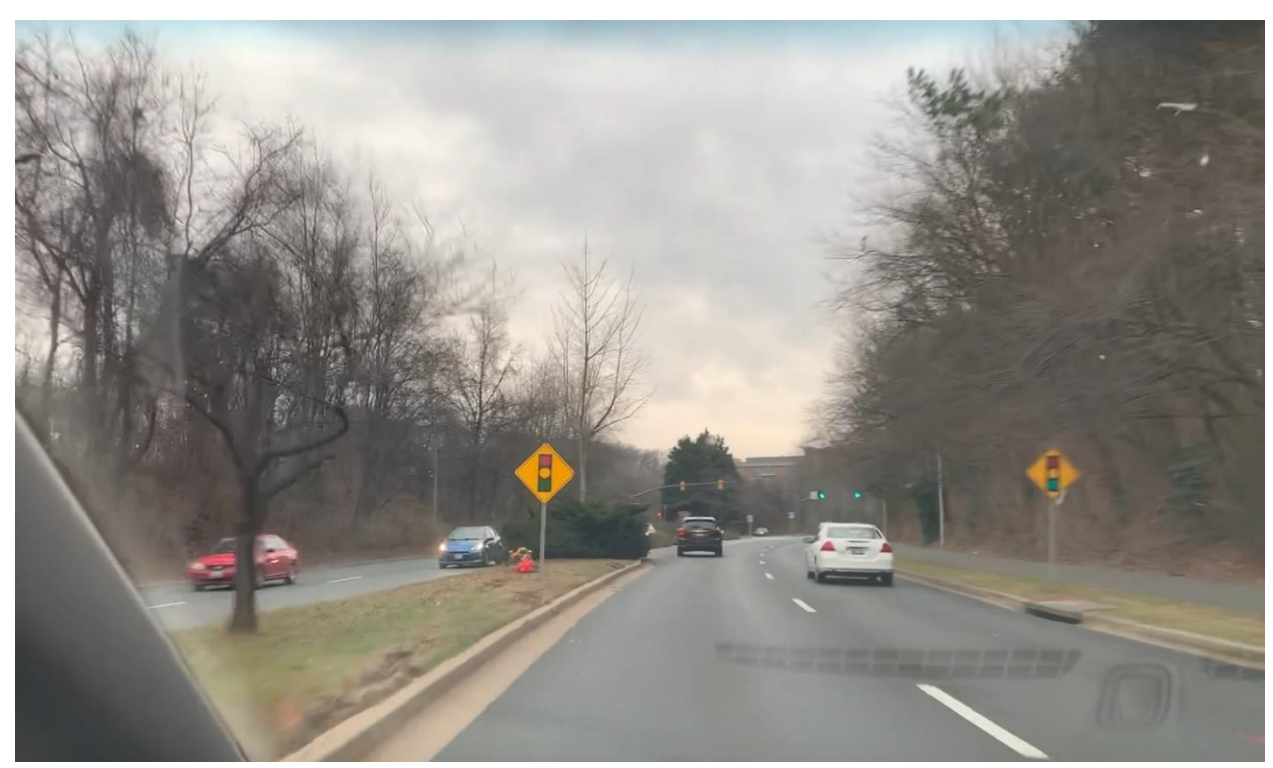
Eastbound West Gude Drive, approaching Watkins Pond Boulevard (crash location)