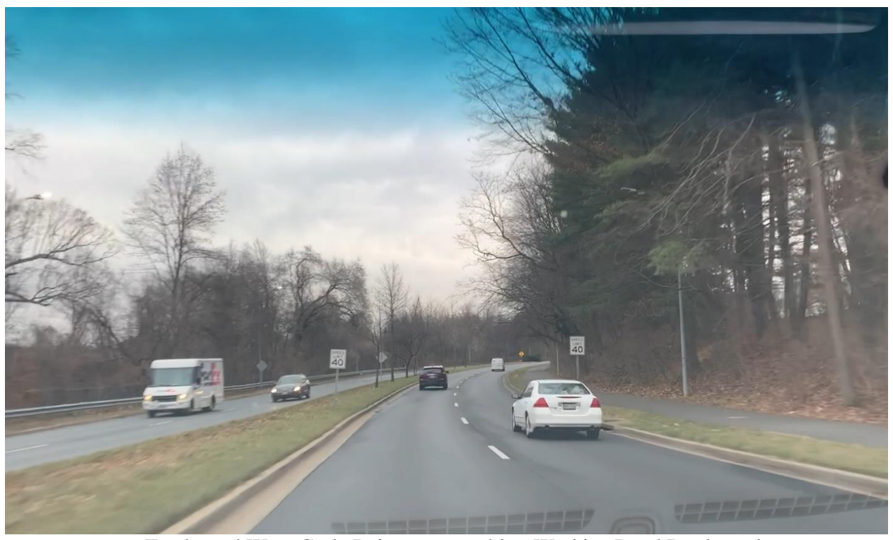
Eastbound West Gude Drive, approaching Watkins Pond Boulevard