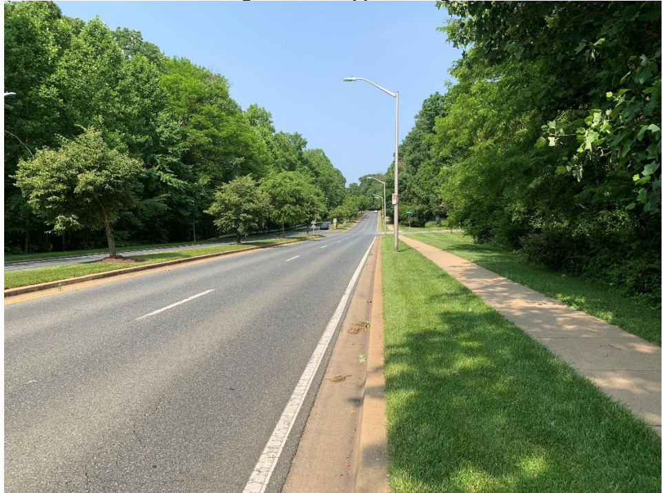
Eastbound East Village Avenue at Plum Creek Drive

Westbound East Village Avenue approaching Plum Creek Drive