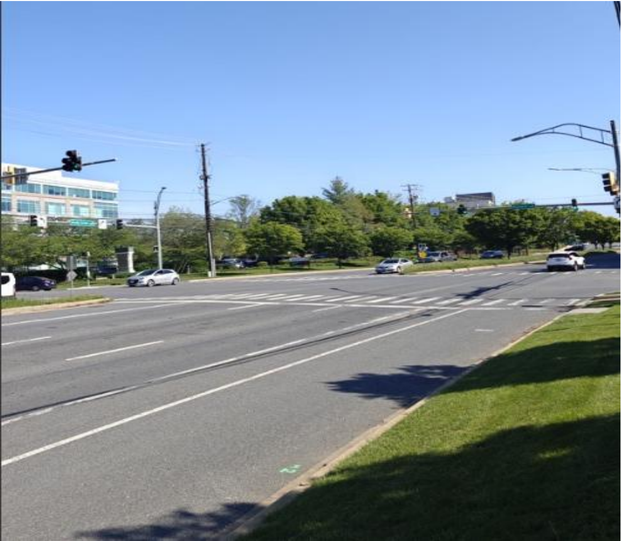
Southbound Shady Grove Road north of crash location