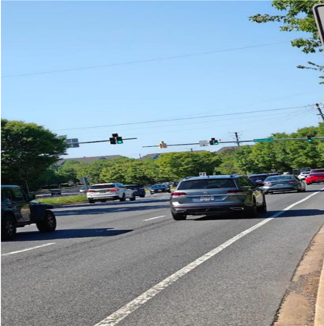
Northbound Shady Grove Road south of crash location