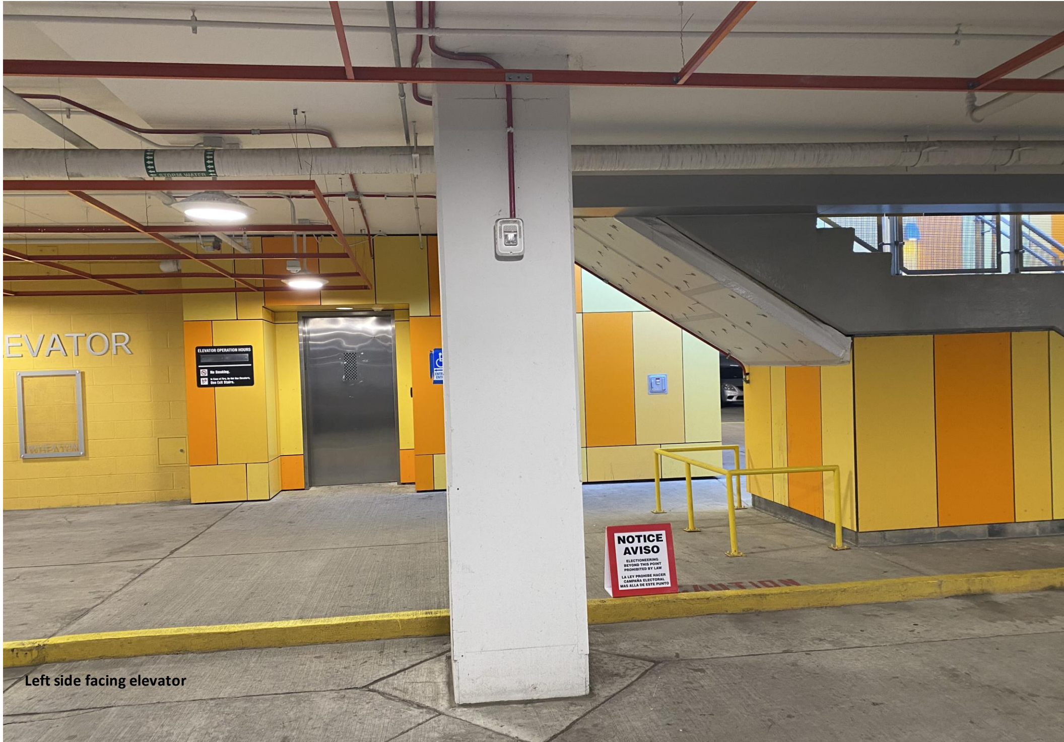
Left side facing elevator