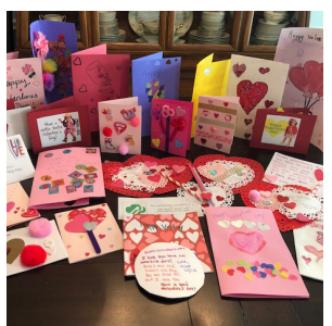
"...knowing you're there if I need you is like a great wall of loving support... you make a big, wonderful difference in my life!"

Social events, volunteer rides, light yard work, household chores, friendly visits and phone calls, and errands are just a few examples of the services villages offer their members. Over the past two years, villages have filled 13,340 service requests from their members, all of which were done by volunteers.