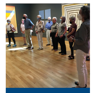
"The informational programming was very helpful. The program on Medicare enrollment was informative. I also liked the museum tours. They were so interesting!"

gathering places. They cover a wide range of topics, such as seminars on Medicare enrollment, financial planing or end of life planning, history, art, local issues, and public health. Villages leverage relationships with professionals and nonprofits its in the area to bring programs on improving health to our communities: fall prevention, safety at home, loss of hearing, signs of dementia, dealing with anxiety, and all kinds of exercise.