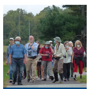
"My conversation with H. was a lift in the midst of very difficult times."

One of the greatest challenges during the pandemic was social isolation, which impacted all ages but had hurt older adults especially hard. Villages were extremely creative and effective in addressing the social needs of their members.