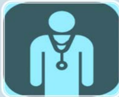
Part B Medical Insurance