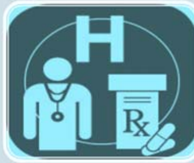
Part C Medicare Advantage Plans (like HMOs and PPOs). Includes Part A & B and sometimes Part D coverage