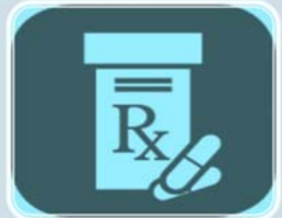
Part D Medicare Prescription Drug Coverage