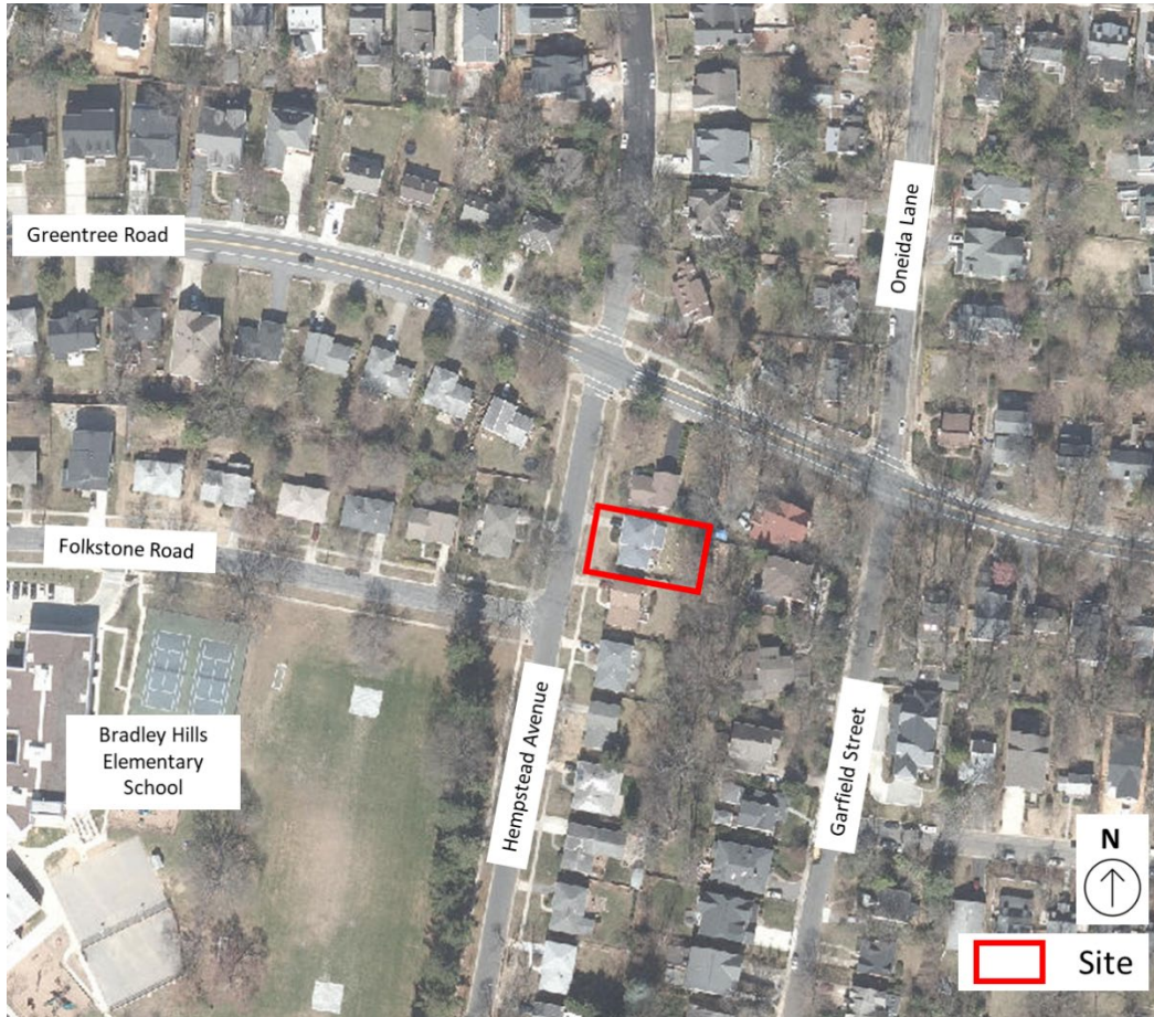
Figure 1: Vicinity Surrounding the Site

The Subject Property (“Property” or “Site”) is located at 8801 Hempstead Avenue in Bethesda otherwise known as Lot 2, Block 16 of the Bradmoor Subdivision. The Site is improved with a detached single-family dwelling (Figures 1 and 2) and Applicant has operated an eight-child Family Day Care on the premises since 2019. Inside of the dwelling, the day care includes two (2) playrooms and a napping room. The rear yard of the Property is enclosed by a 6-foot-tall fence and serves as an outdoor play space for the daycare.