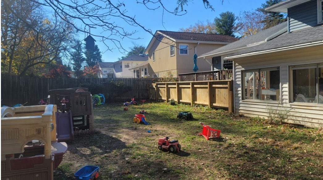
Figure 5: Rear yard outdoor play space.