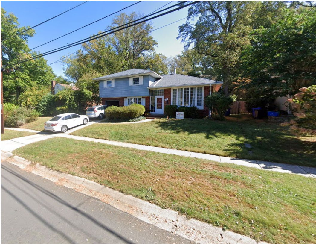
Figure 4: Front view of the Site looking northeast from Hempstead Avenue.

Parent drop-off and pick-up times are staggered from 7:00 a.m. to 9:00 a.m. and 4:00 p.m. to 6:00 p.m. respectively. The Applicant has no existing or proposed signage included as part of this Application.