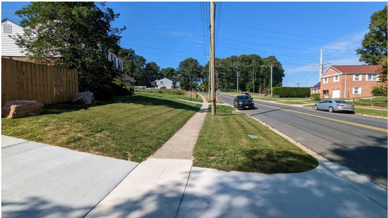
Driveway entrance from street