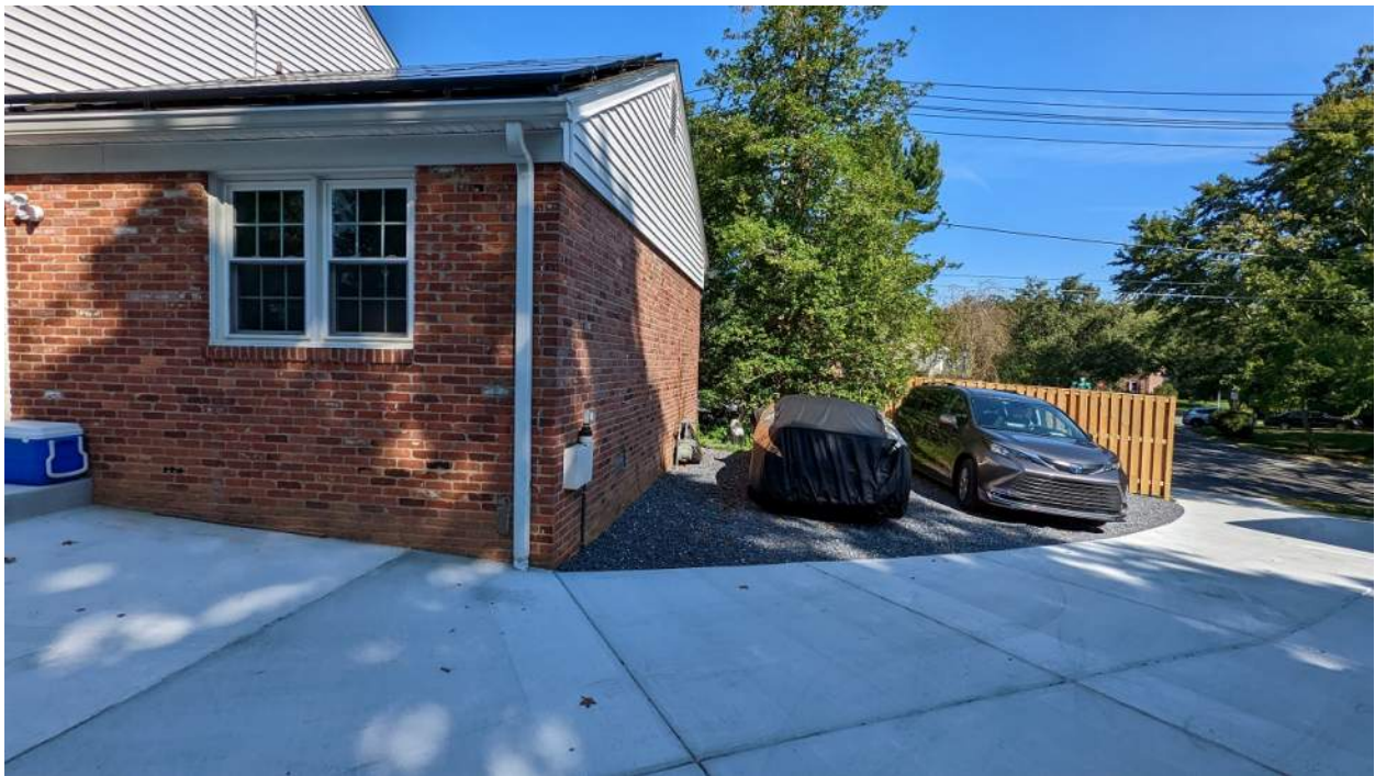
Gravel parking located at rear house