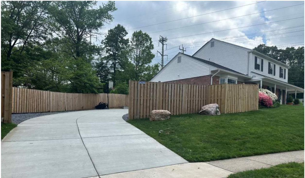
Fence and concrete driveway exit (photo taken 5/7/2024)