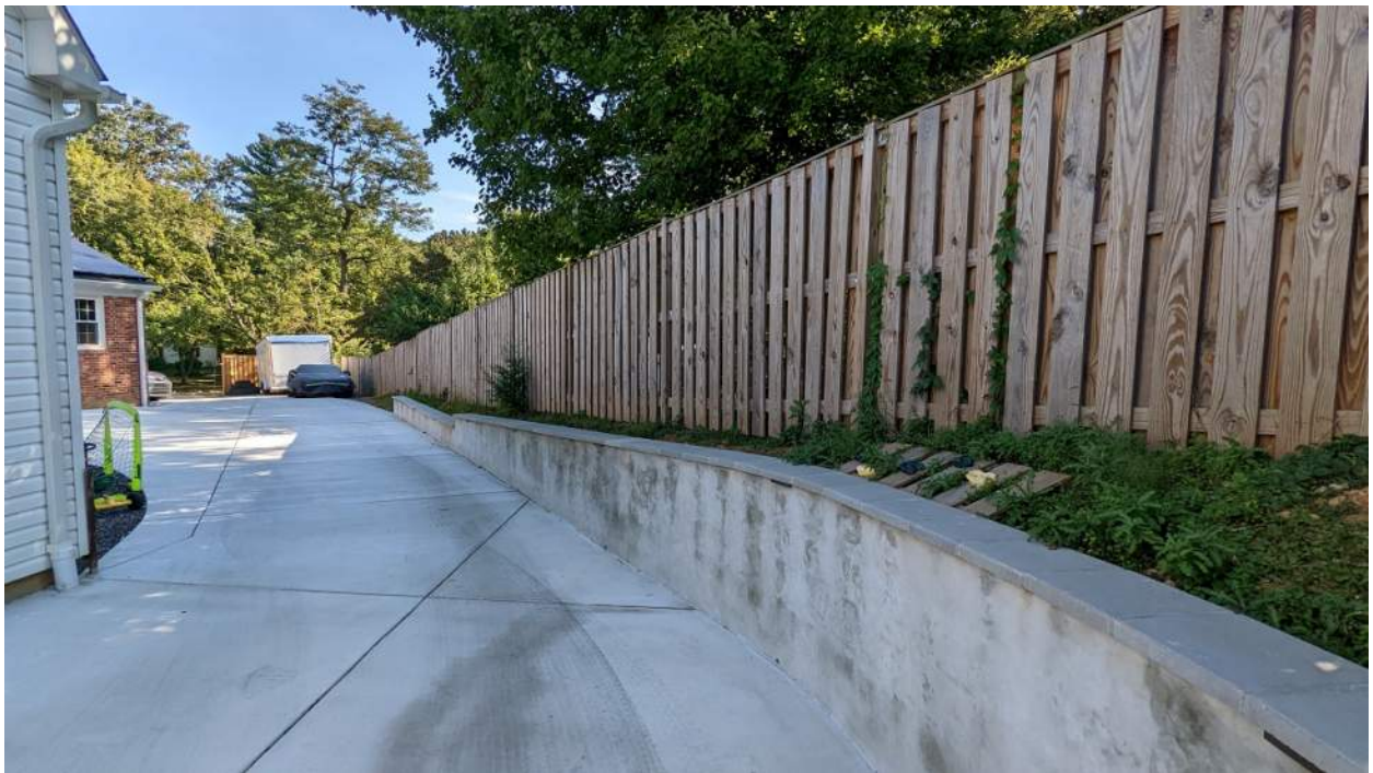
Retaining wall around rear of property