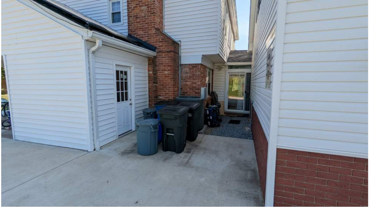
Side entrance to house