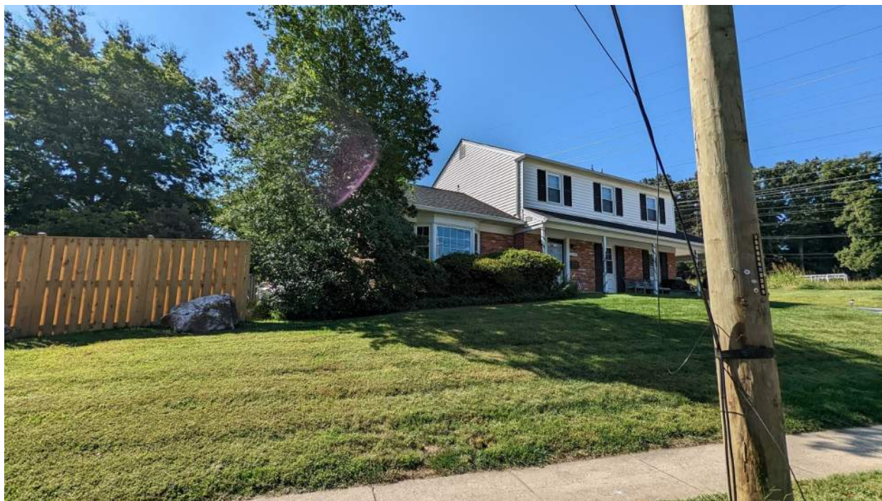
Subject property from street view