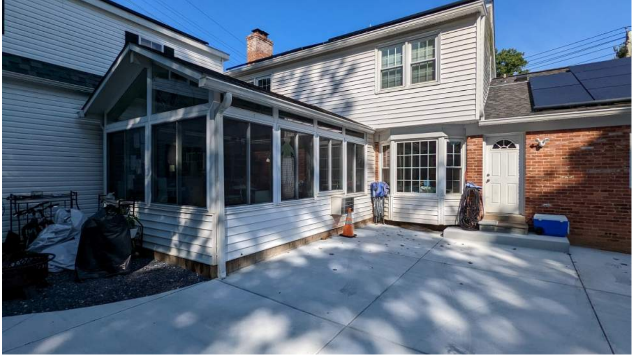
Rear of house