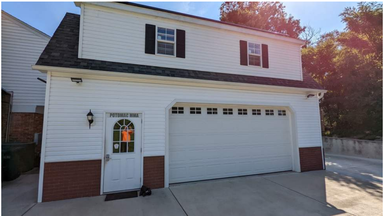
Garage used as MMA Training studio