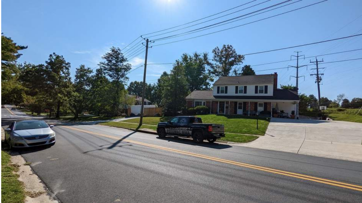
Street View of subject property