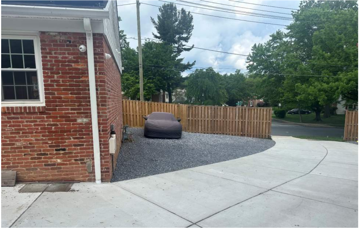
Fence and gravel parking area (photo taken 5/7/2024).