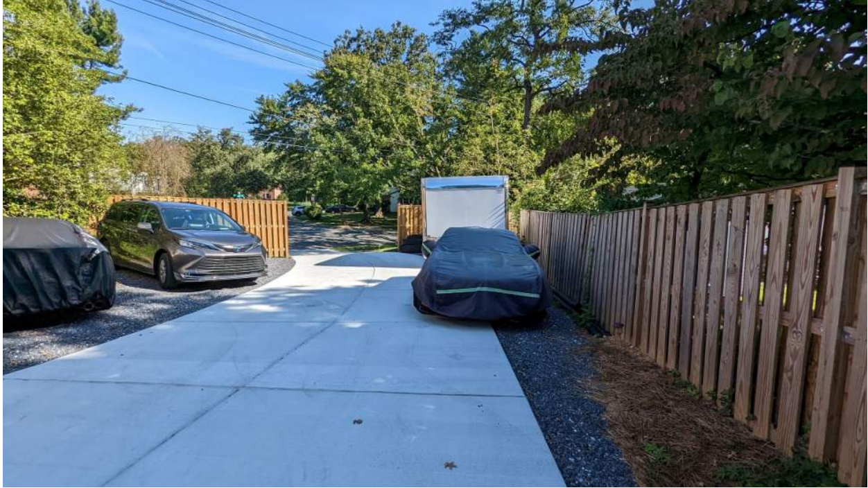
Driveway located opposite side of garage/studio