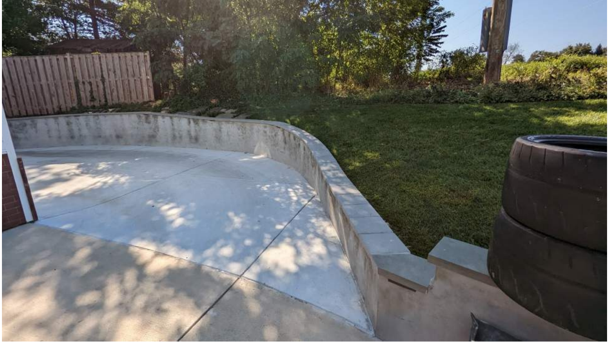
Retaining wall located at rear of property