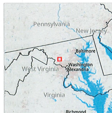
Exhibit 49 (c) OZAH Case No: CU 25-02