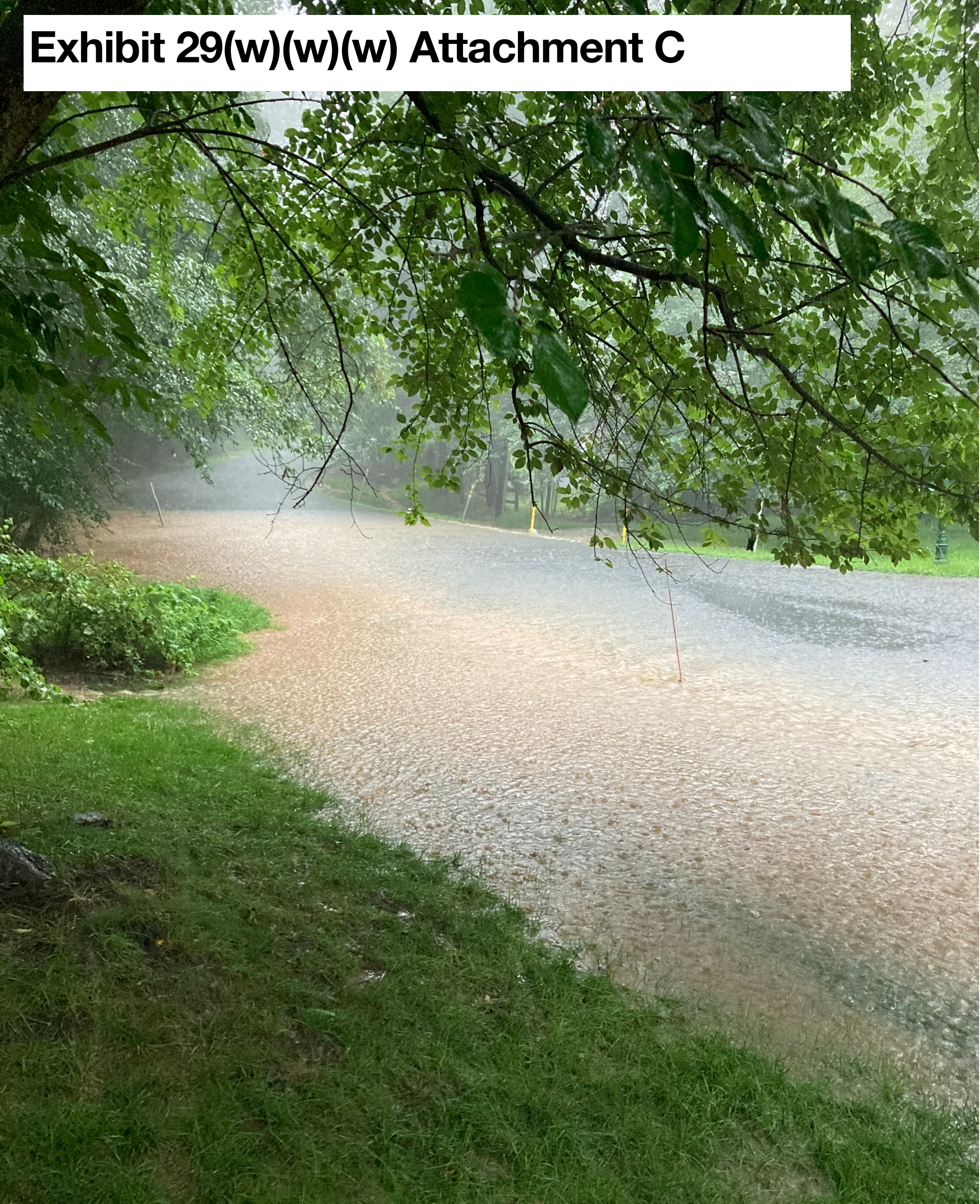
C.5. July 19, 2025. View looking South down Shannon Drive showing street flooding.