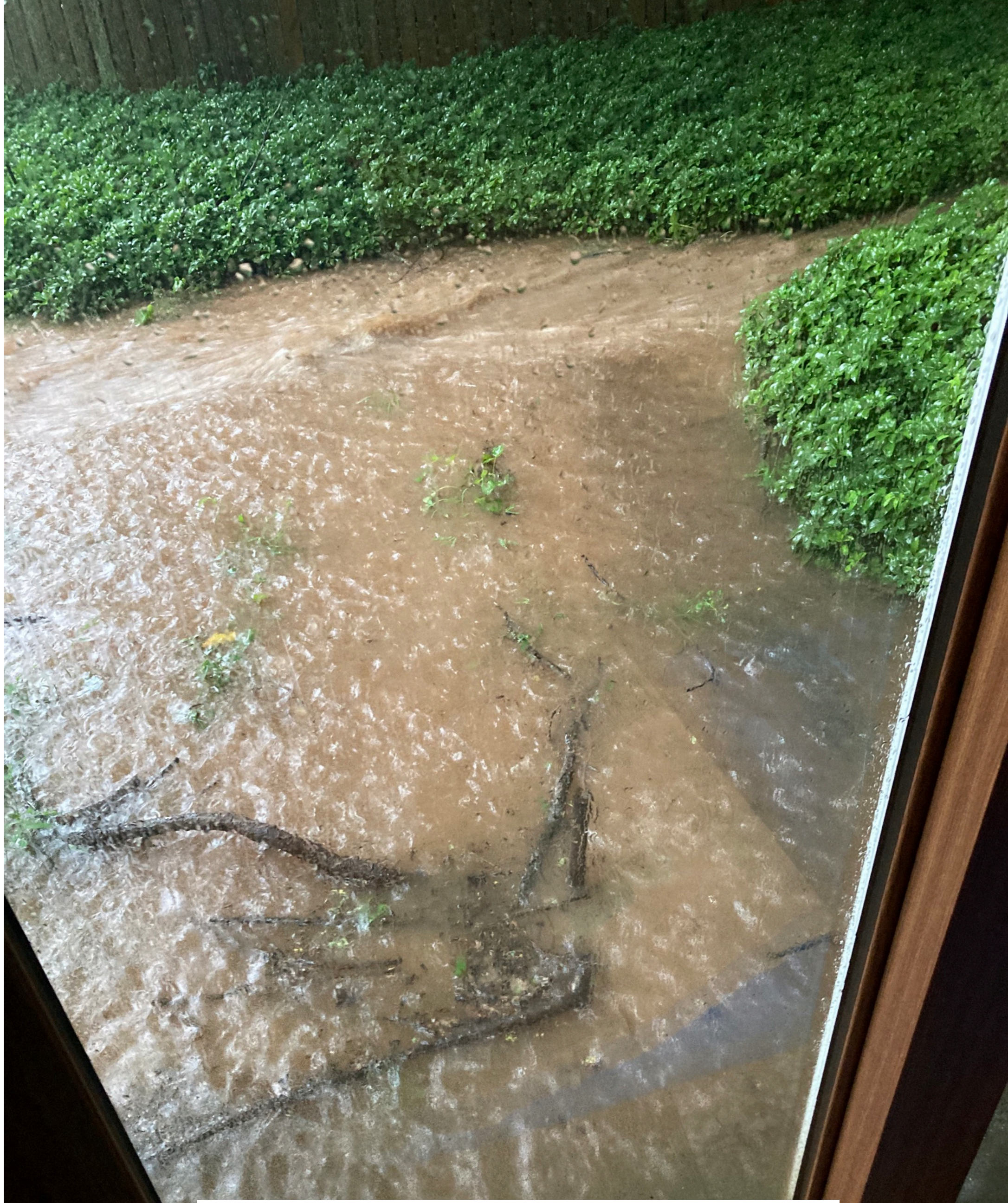
C.7 July 19, 2025. Stormwater runoff passing less than 5 feet from basement door of 13811 Shannon Drive