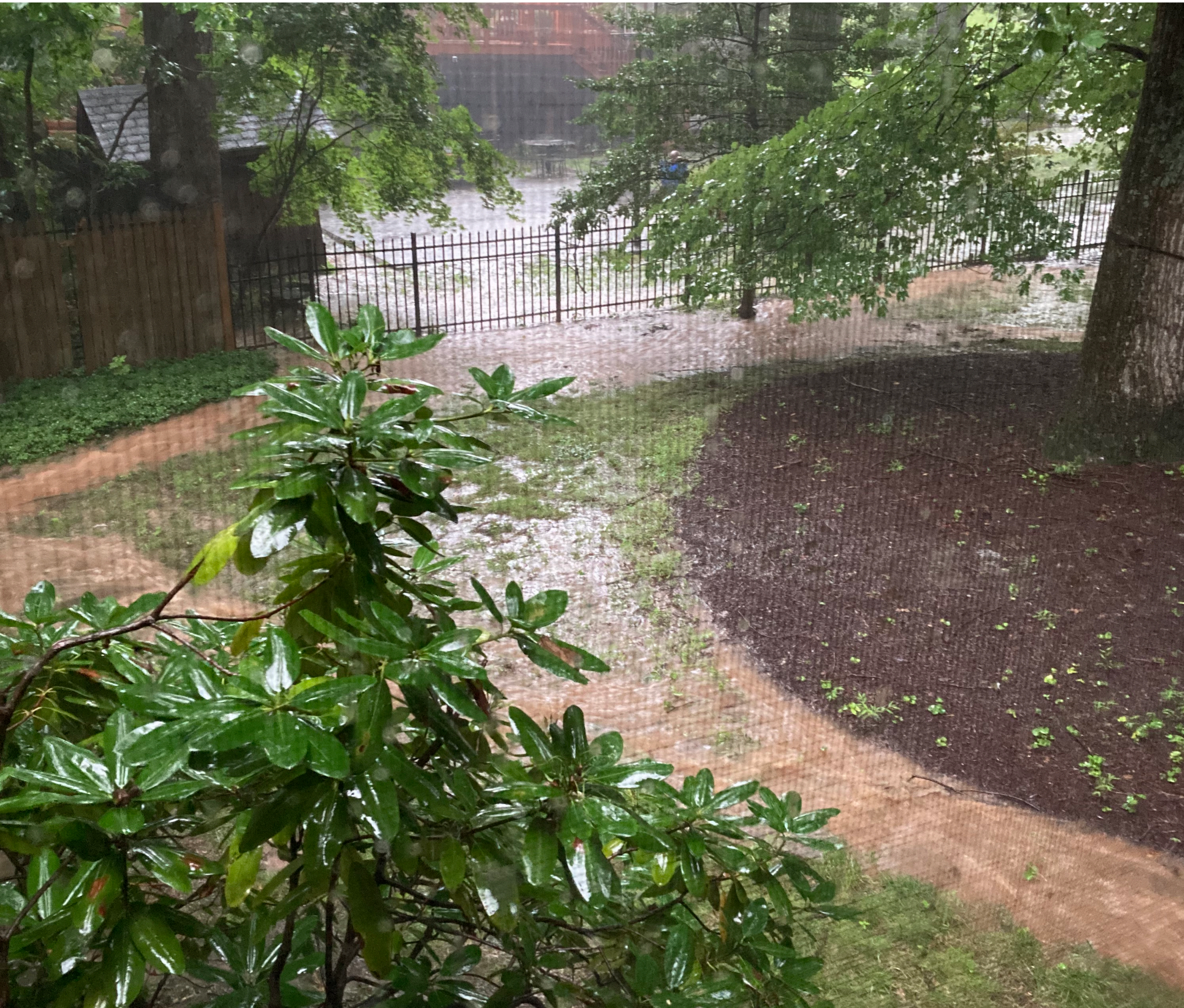
Exhibit 29(w)(w)(w) Attachment C