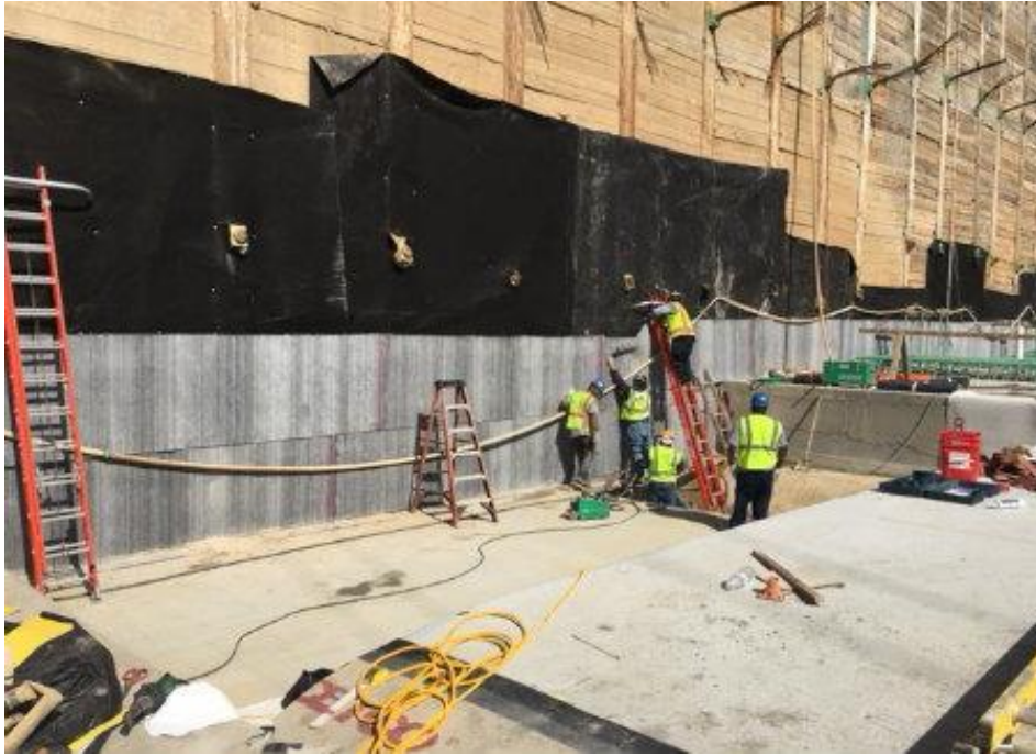
Wall Pour 3 on July 26, 2018