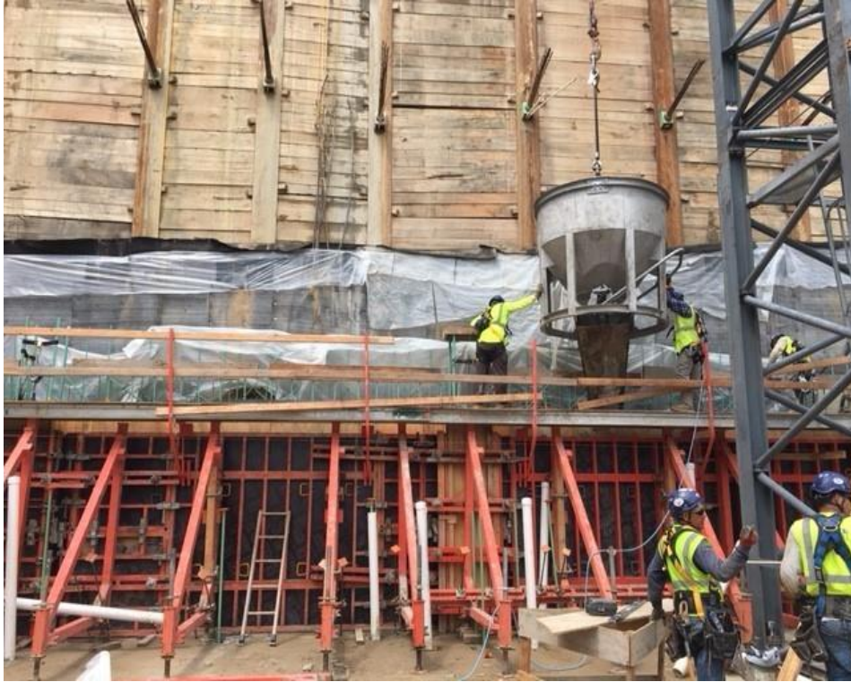
Level P4 Slab Pour 7 on July 27, 2018