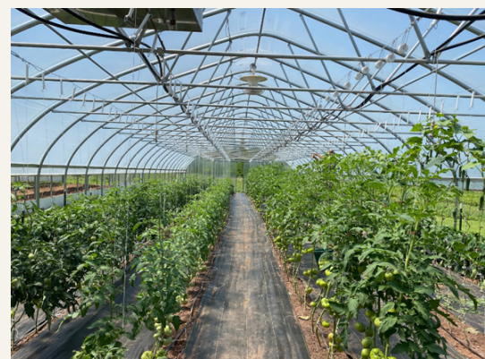
One Acre Farm 2022