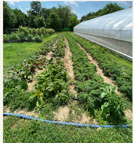
Common Root Farm 2022