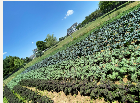
Dodo Farm 2022