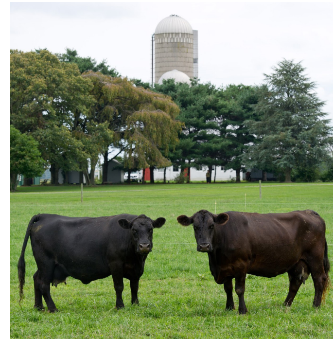
Beef farm in Kennedyville, Maryland.

Flyer produced by the Maryland Sustainable Growth Commission's Rural Economies Workgroup (Subcommittee on Sustainable Food and Food Production)