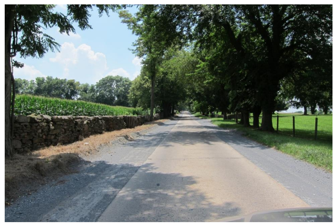
The historic wall and the fences and entry features along Martinsburg Road contribute to the character of the road; they are within the recommended 80-foot right of way.