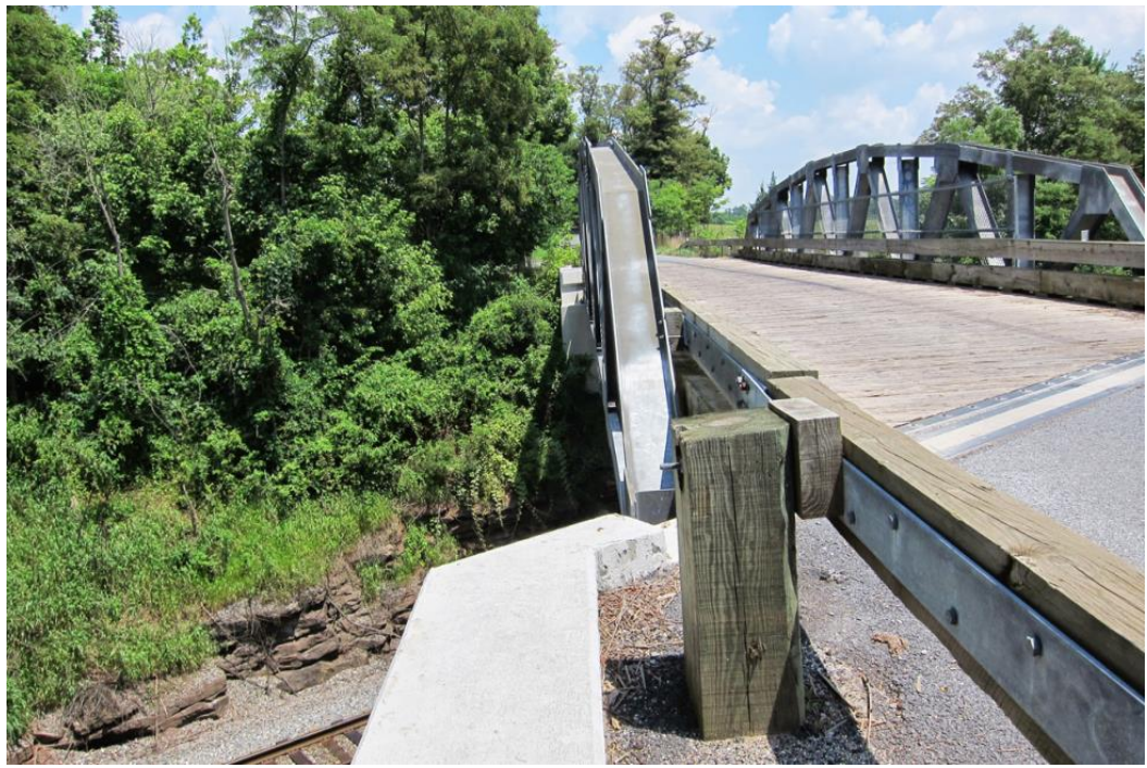
Steel-backed timber guardrail used on the Mouth of Monocacy Bridge.