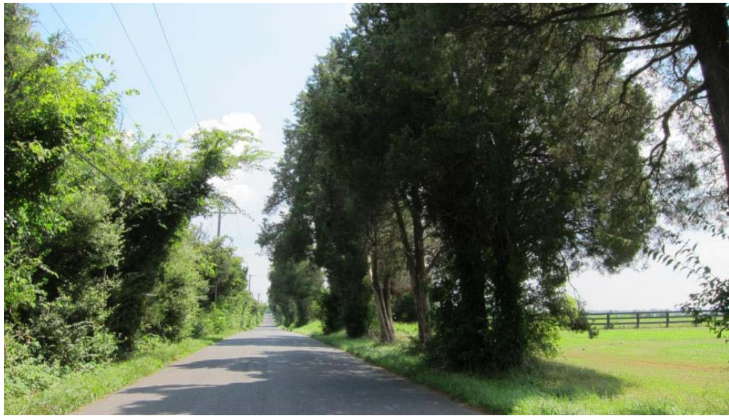
Eastern red cedar hedgerows have traditionally been planted along many roads (Hughes Road is shown above).