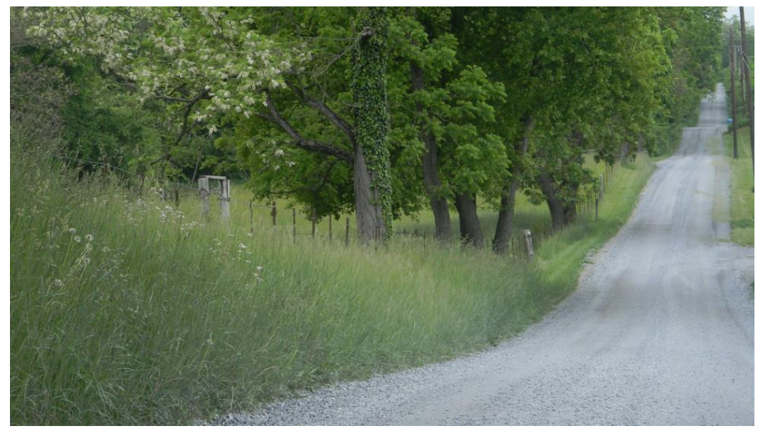
The gravel surface on West Harris Road near the town of Barnesville maintains the character of this historic farm wagon road.

The natural topographic characteristics of the roadway and how it fits into the landscape should be preserved to the maximum extent practical. Where documented safety problems are of a magnitude to justify changing the vertical or horizontal geometry, design techniques and materials must be compatible with adjacent unaltered portions of the road. Relocated sections must be designed to maintain compatibility with the connecting road segments and in general, should have similar width and surface.