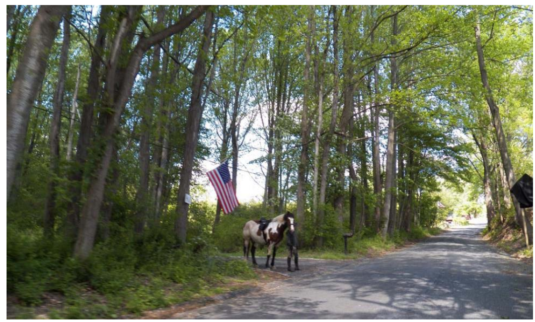
Horses, pedestrians, bicyclists, and farm equipment all share the rustic roads with automobiles and trucks.