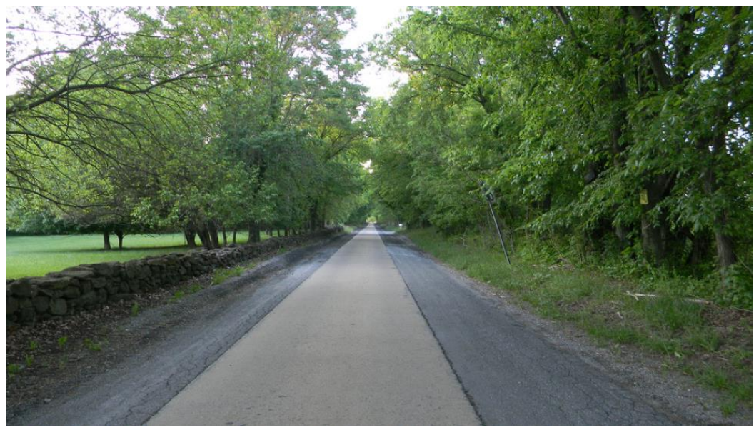
Martinsburg Road is an Exceptional Rustic Road. The well-preserved one-mile, one-lane concrete section, called a politicians road, is bordered by historic stone fences, and is designated in the Montgomery County Master Plan for Historic Preservation.

The criteria for an exceptional rustic road are: