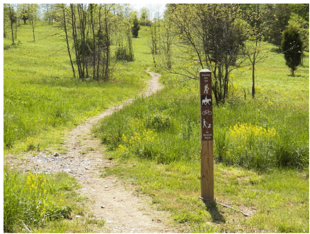
A brown trail sign for Browning Run Trail in Little Bennett Park.