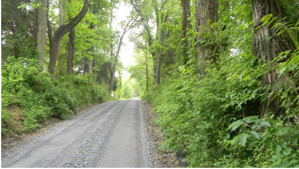
Hedgerows and tree canopy along West Harris Road.