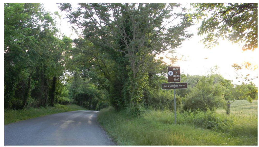
Subtle, brown signs fit with the character of this section of Martinsburg Road near Wasche Road.