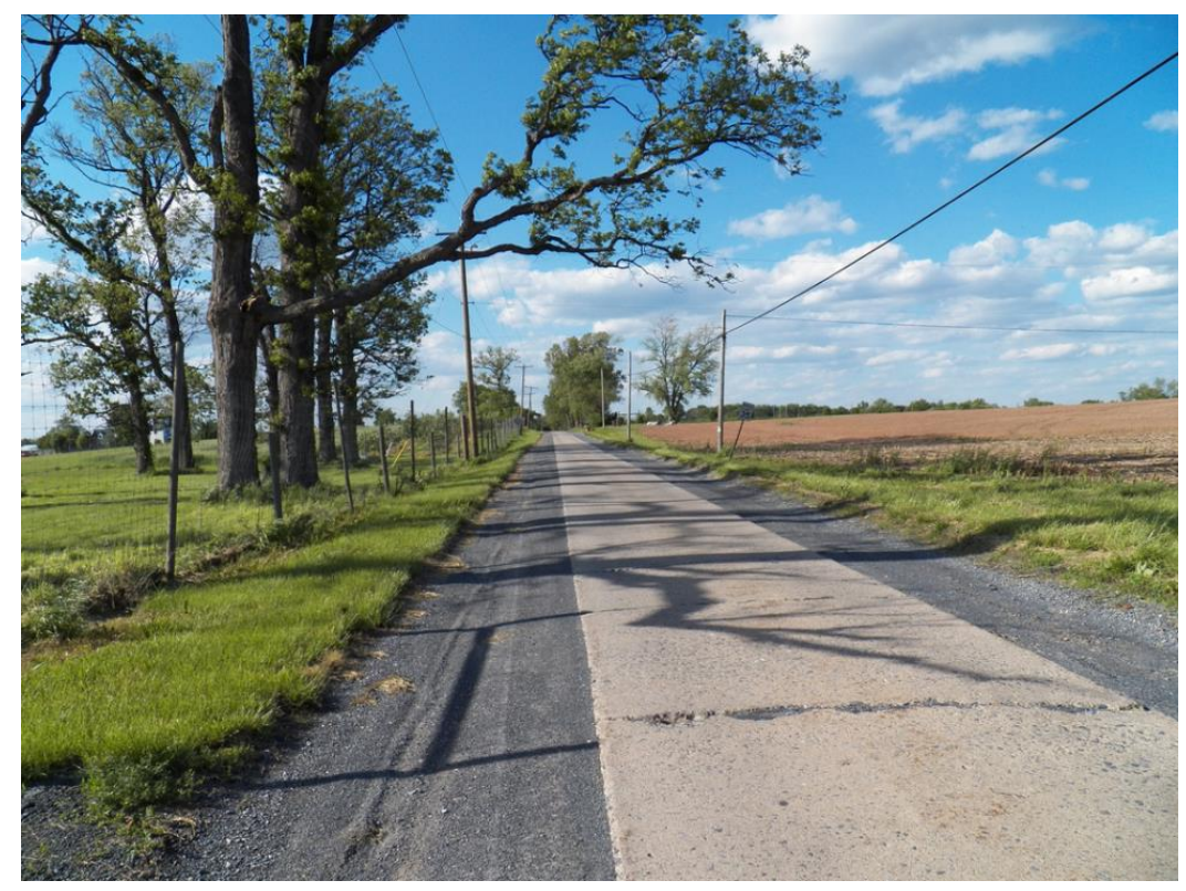
Proper maintenance of the historic concrete sections of the politicians' road along Sugarland Road has helped protect this 1930s era pavement.