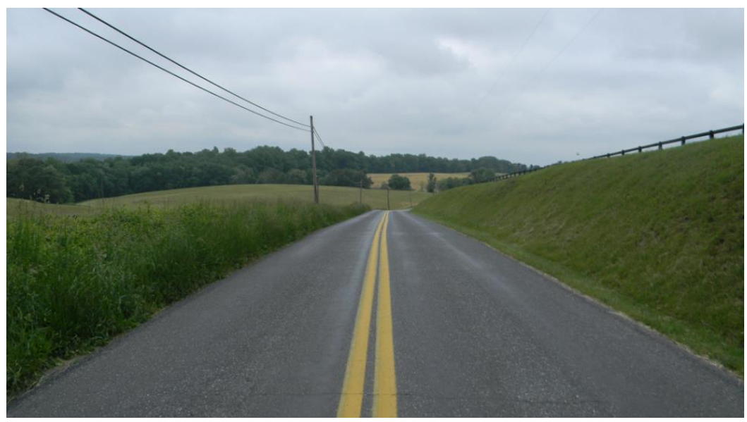
Comus Road is an example of a Rustic Road with "outstanding farm and rural vistas," as they are described in the Rustic Roads Functional Master Plan.

Montgomery County Code, Chapter 49, Article 8 established the basis for the program and for the Rustic Roads Advisory Committee (RRAC).<sup>4</sup> Following the enactment of the aforementioned code by the Montgomery County Council in 1993, Montgomery County Executive Regulation Number 21-96 – Rustic Roads was approved by the County Executive in 1996.<sup>5</sup> This regulation provides guidelines for maintenance and improvements to the County's rustic roads and is incorporated in the Code of Montgomery County Regulations (COMCOR) 49.79.01 . Also, in 1996, The Maryland-National Capital Park and Planning Commission (M-NCPPC) adopted a Rustic Roads Functional Master Plan (RRFMP) which designated 66 roads in the County as rustic or exceptional rustic roads. Additional rustic roads have been added by area master plans in Clarksburg/Hyattstown, Cloverly, Damascus, Fairland, Great Seneca Science Corridor, Olney, Potomac and Sandy Spring/Ashton. There are now 97 roads that have been designated as either rustic or exceptional rustic roads.