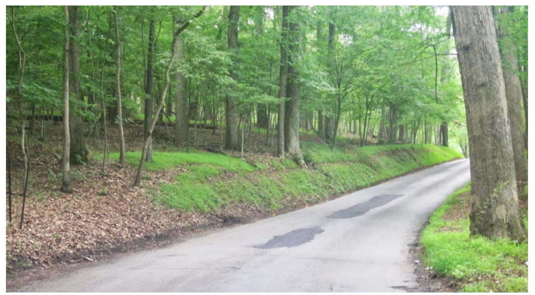
The mature woodlands on Davis Mill Road are a significant feature of the road.

<u>Significant features</u>. Where roadside foliage and trees are listed as significant features of a rustic road, they should be maintained in good condition, and consideration should be given to enhancing the feature.