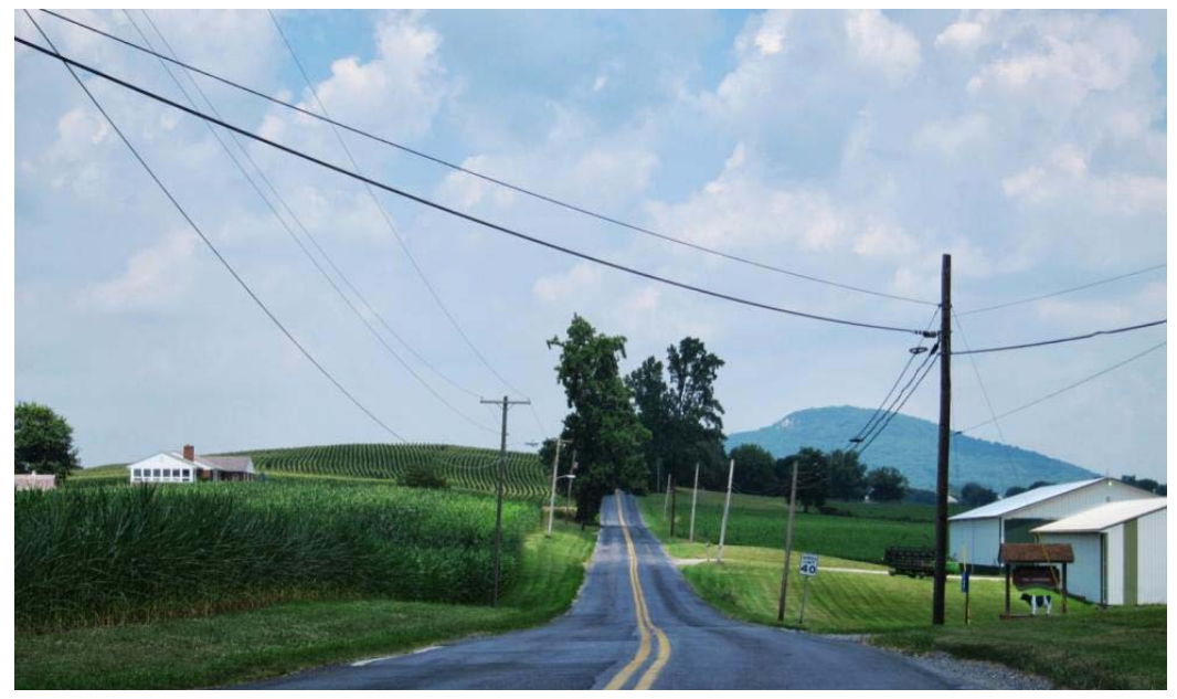
The significant features of Mount Ephraim Road include being a ridge road with expansive views and the alignment leading toward Sugarloaf Mountain, seen here.

A road within the Agricultural Reserve or adjoining rural areas (areas where the majority of zoning is RDT, <sup>2</sup> RC, or Rural) in Montgomery County, which enhances the rural character of the area due to its particular configuration, alignment, scenic quality, landscaping, adjacent views, or historic interest, and which exemplifies the rural and agricultural landscape of the County.<sup>3</sup>