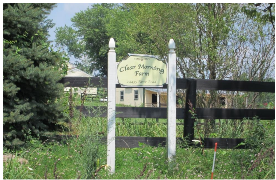
A wooden sign marks a farm on River Road near Whites Ferry.