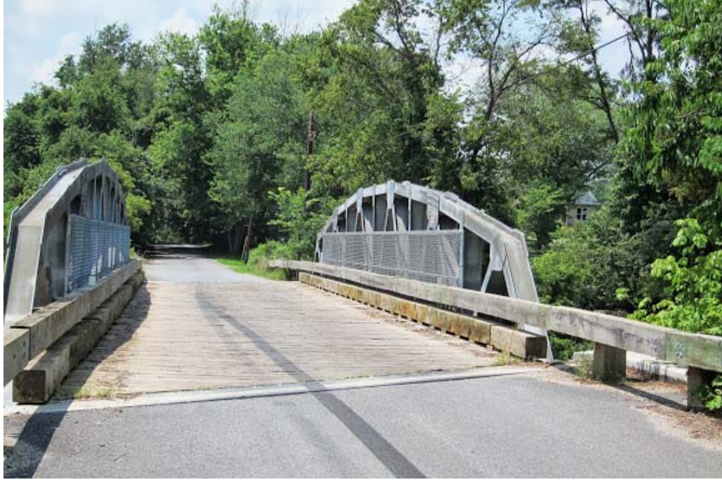
This replacement bridge at Mouth of Monocacy Road over the CSX railroad follows the profile of a pony truss, and is sympathetic to its rustic surroundings.

Repair and restoration of a rustic road must be made to all damaged pavement and edges within the public right of way. These repairs must be made in accordance with the approved plans and as directed by Montgomery County's Department of Permitting Services.