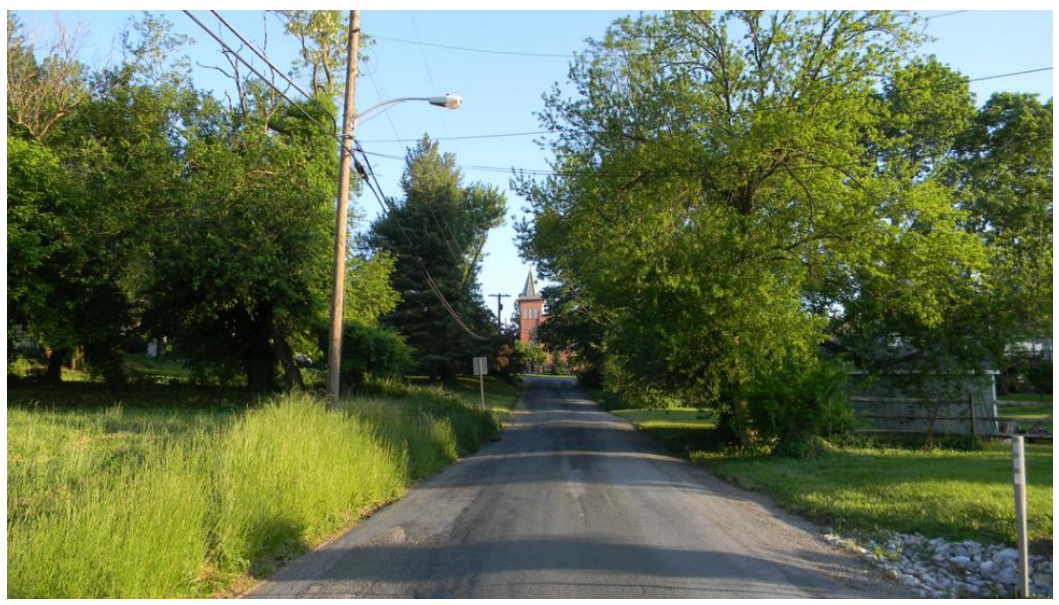
Rustic roads can have both scenic and historic vistas, as seen here on West Harris Road coming into the town of Barnesville.

maintenance. When a property along a rustic road is subdivided, the property owner is required to dedicate a right of way – usually 70 feet total width for a rustic road and 80 feet for an exceptional rustic road. These rights of way allow the County to protect a buffer along the roadside edge in addition to the road itself.