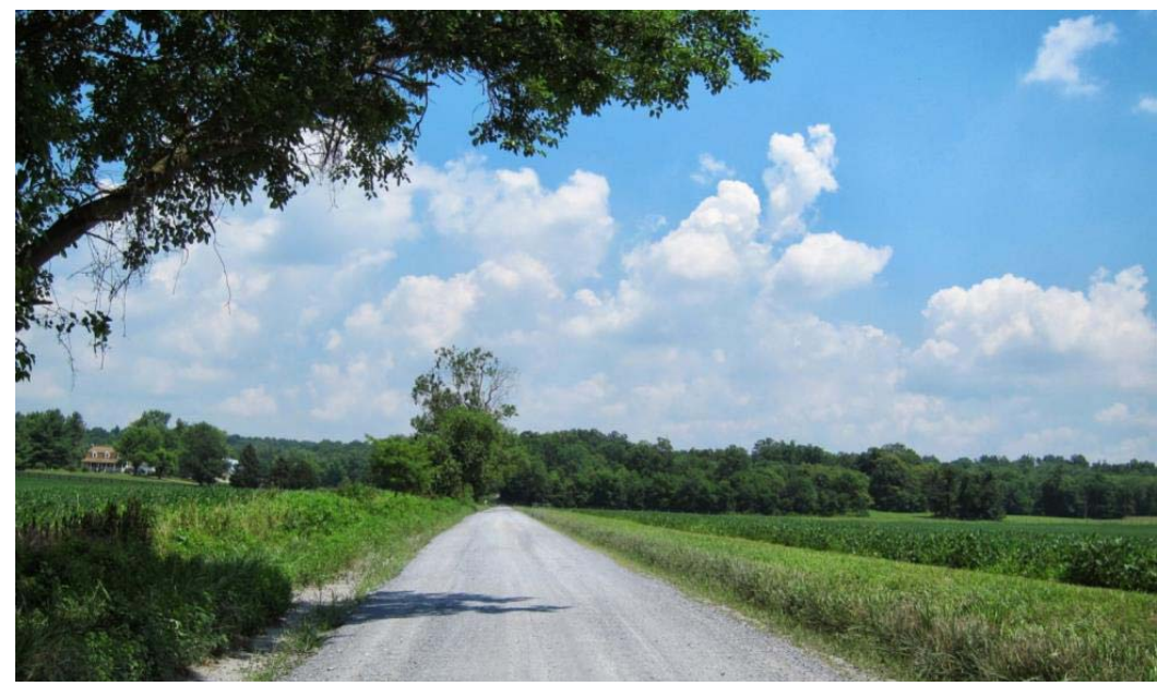
The unpaved section of River Road from Whites Ferry to Edwards Ferry Road is designated as an exceptional rustic road. The open views along the road are a significant feature. The C&O Canal Scenic Byway also follows River Road to Whites Ferry.

Two other agencies have limited areas of responsibility for rustic roads: