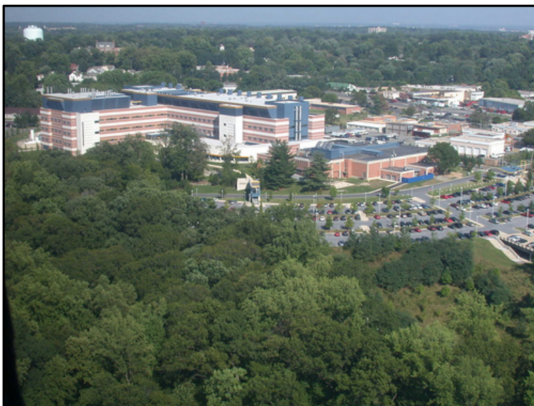
View of Building 511 Landfill Site

This FTGL-04 landfill site is located in the vicinity of Buildings 511 and 503 and the Motor Pool. Waste disposal at this site likely occurred from the 1940s up into the early 1970s, when construction of Building 511 and the Motor Pool was completed. Two incinerators were once operated north of Building 511. The first incinerator was built in 1957 and operated until 1970; it was used to incinerate papers, contaminated wastes, animal bodies and garbage. From 1970 until 1984, a replacement incinerator was used to incinerate animal bodies and bedding. Ash from the incinerators was reportedly buried in the Forest Glen Annex landfills. Medical wastes were uncovered during excavation associated with the construction of the parking lot southwest of Building 511. During the construction of Building 503 in 1997, it was reported that approximately 1,700 truckloads of waste were removed and transported to the landfill at Fort Meade. However, waste material was reportedly left onsite at Building 503 after it was determined that removal was unnecessary for foundation construction.