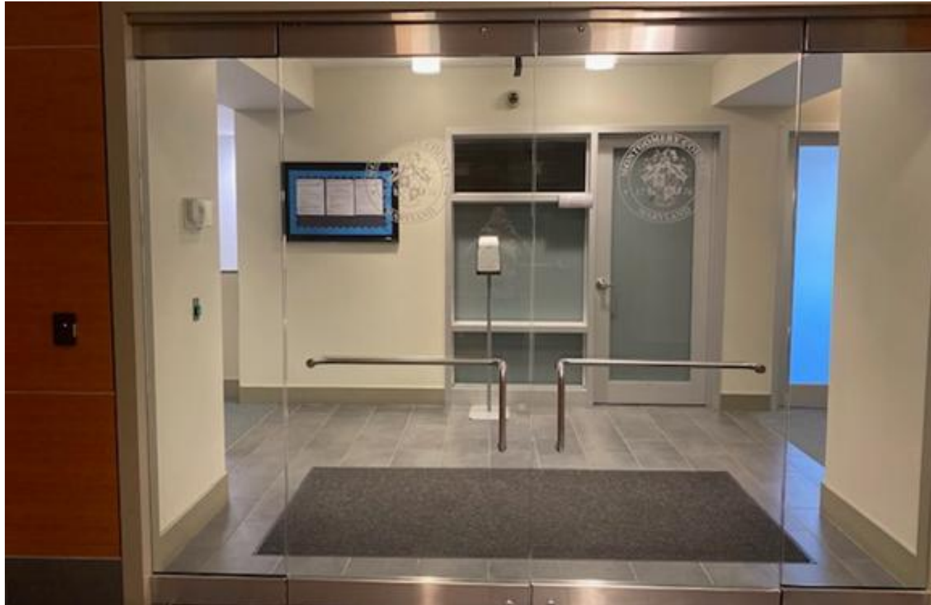
5 th Floor Access