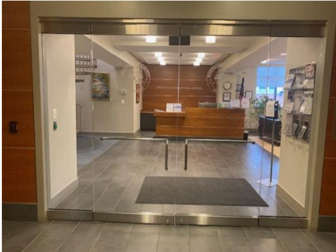
4 th Floor Front Desk