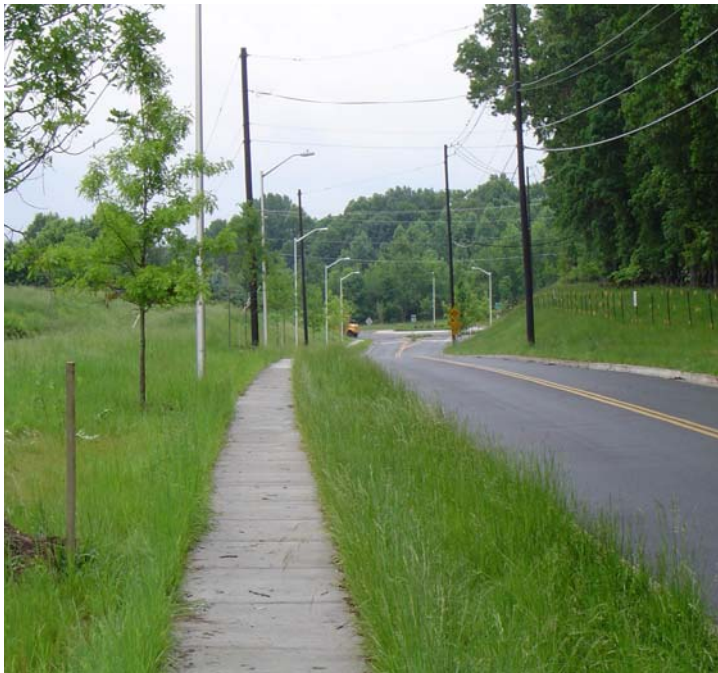
View south towards Germantown Rd./Watkins Mill Rd. intersection.