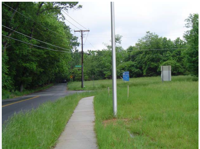
View north towards Watkins Meadow Drive

The Montgomery County Council has only funded Phase I Facility Planning (Concept Plan). Once Phase I is complete, they will review it to determine whether or not to fund Facility Planning Phase II (Preliminary Plan).