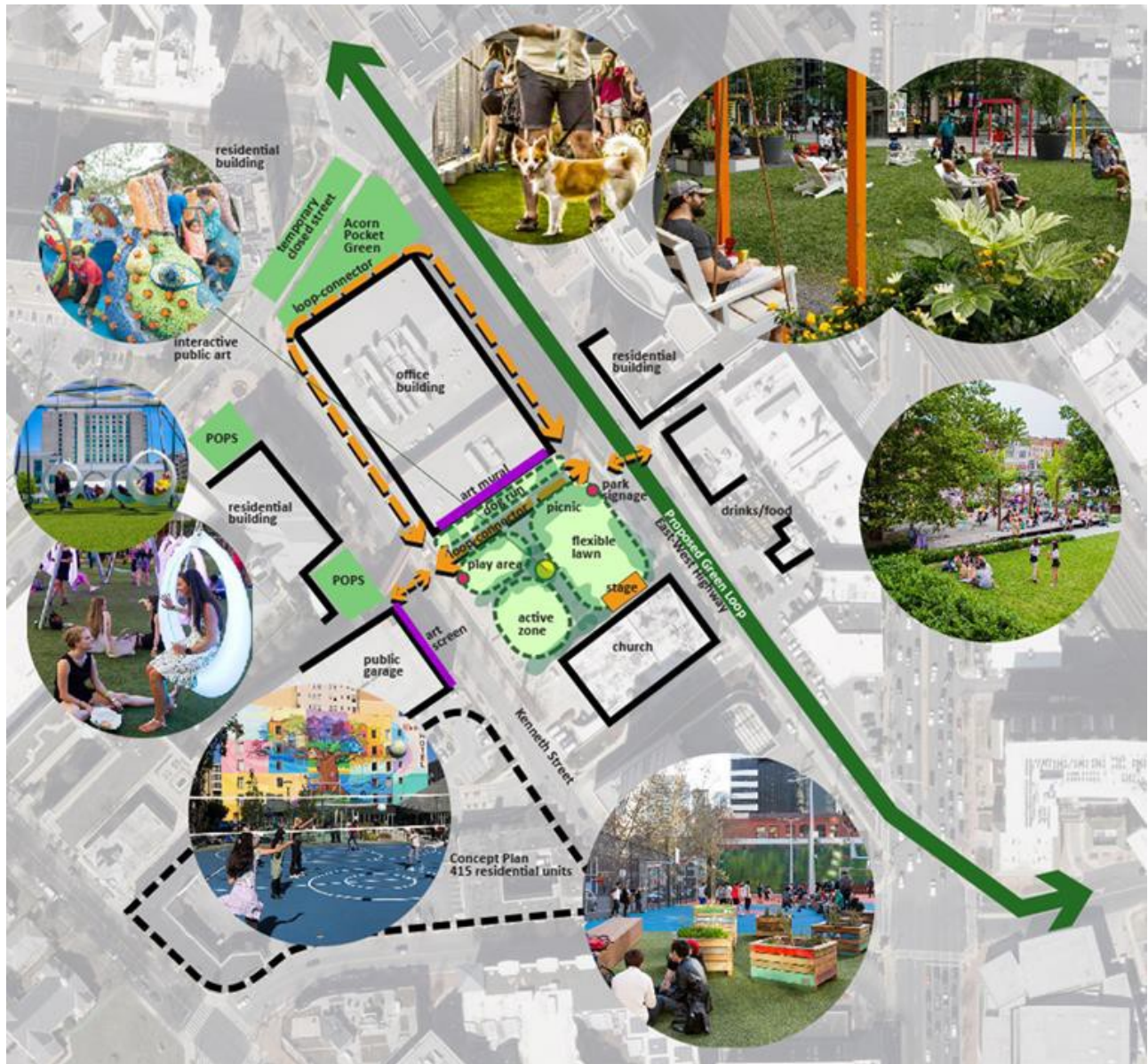
Figure 7: South Silver Spring Urban Recreational Park Concept