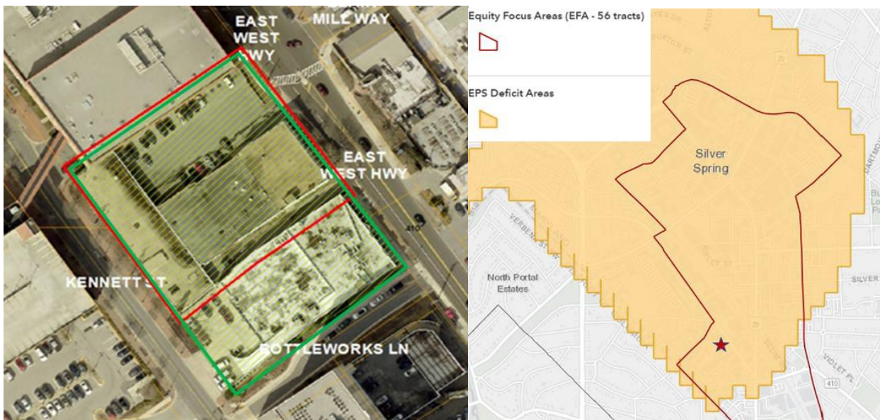
Figure 6: Proposed Urban Recreational Park Site; Equity Focus Area/EPS Deficit Areas Map

Active recreation amenities have the highest deficit in the Silver Spring CBD (more than contemplative and social gathering deficits), so the creation of a new Urban Recreational Park on this site will help close the gap in active recreation within Silver Spring. Another key policy tool indicates that this future park is within the Equity Focus Area (EFA) that covers much of the Silver Spring CBD due to a combination of lower income levels and racial diversity (see Figure 6). In addition to the broad policy support for this park, long-standing requests for urban recreation space from the South Silver Spring community put this site on the priority list for new urban parkland.