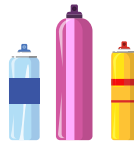
Empty, non-hazardous aerosol cans