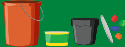
Plastic flower pots, buckets, jars, containers, caps, & lids