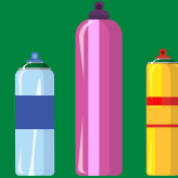
Empty, non-hazardous aerosol cans