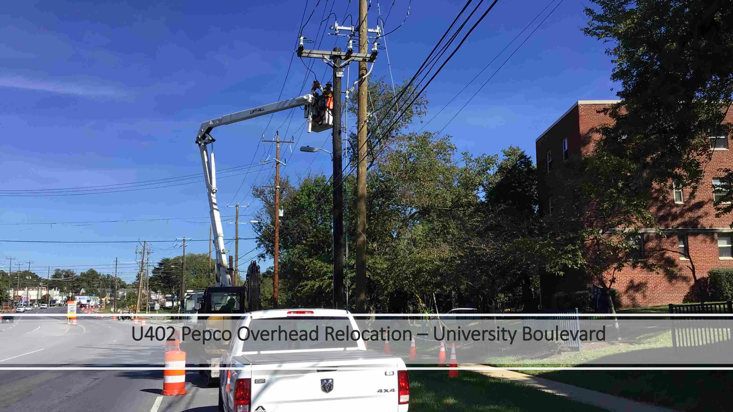
U402 Pepco Overhead Relocation – University Boulevard