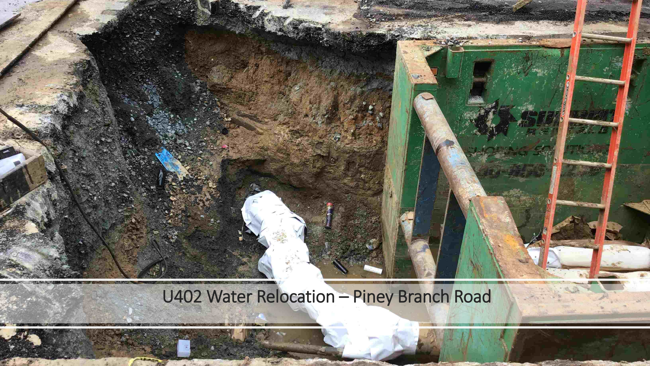
U402 Water Relocation – Piney Branch Road