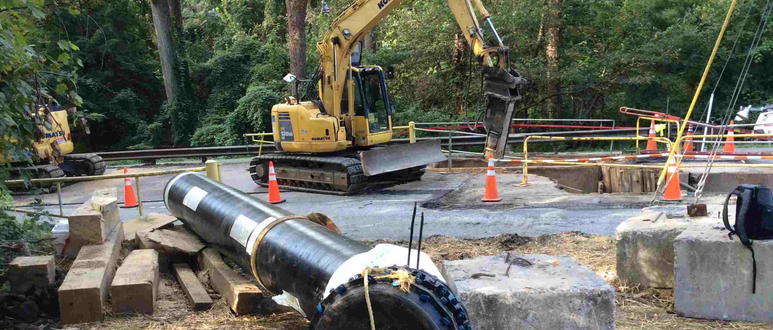
U304 WSSC Water Relocation – Sligo Creek Parkway