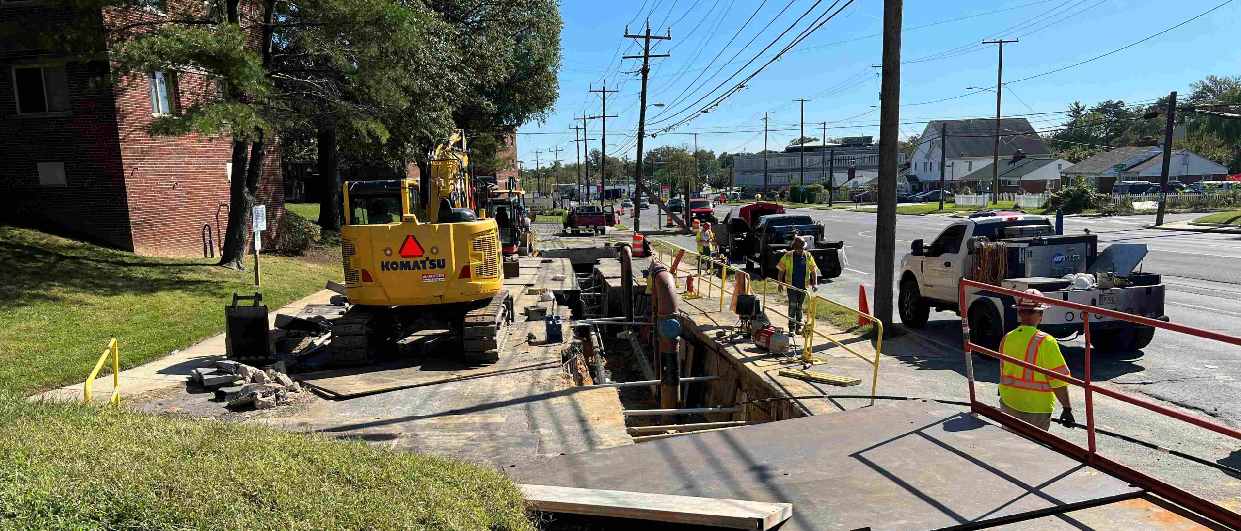
U501 Gas Regulator Station – University Boulevard