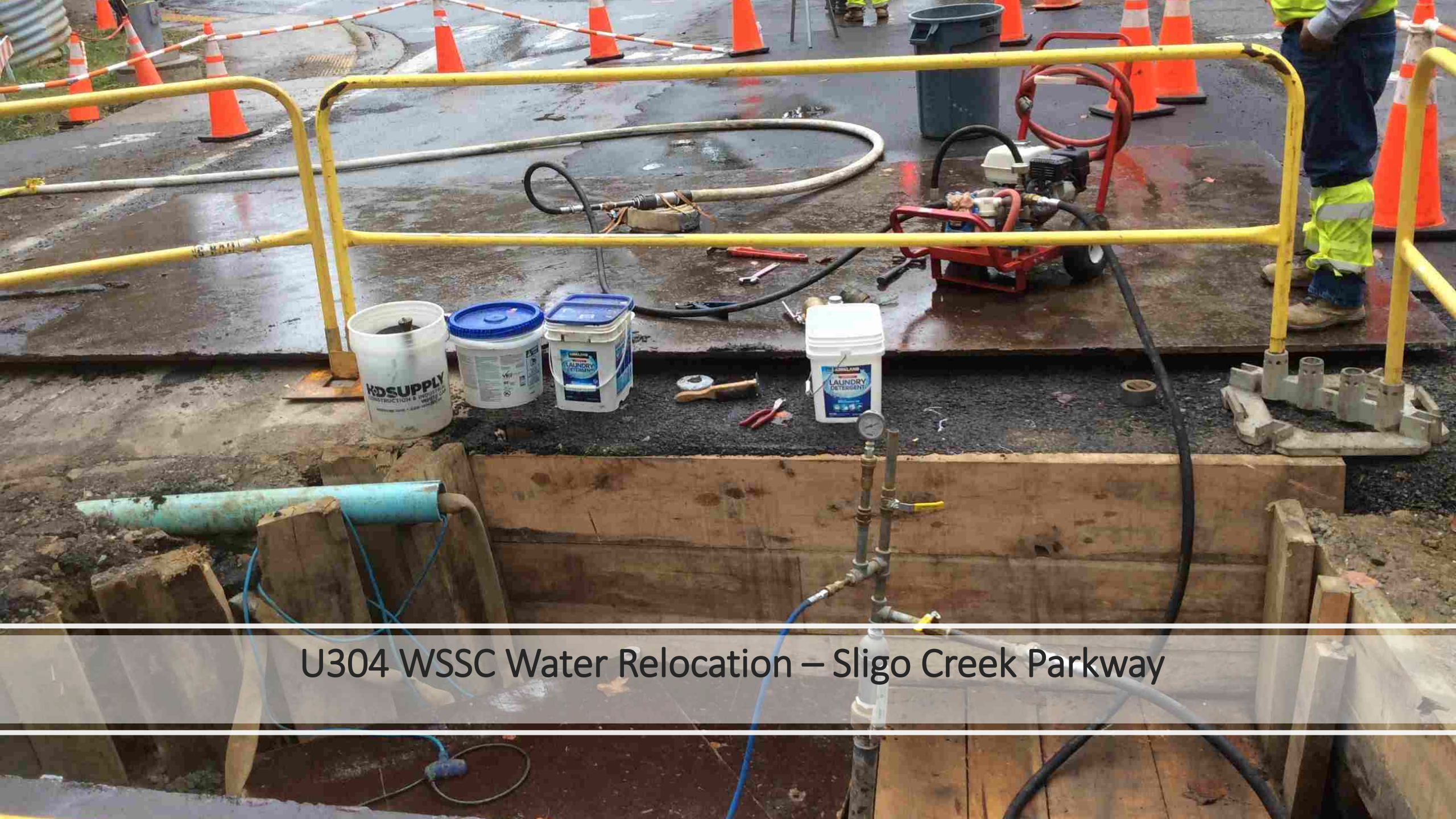
U304 WSSC Water Relocation – Sligo Creek Parkway