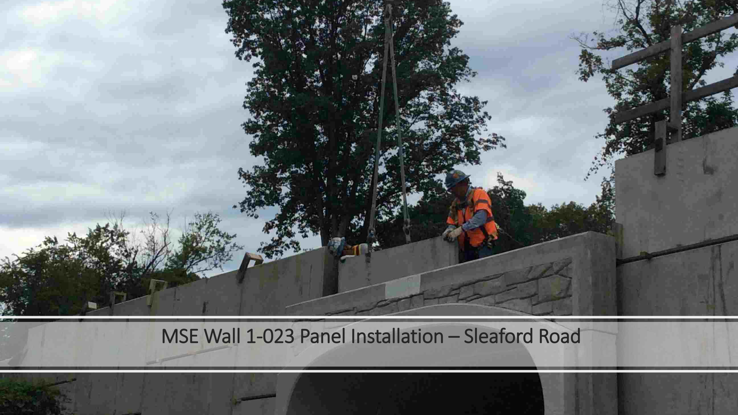
MSE Wall 1-023 Panel Installation – Sleaford Road