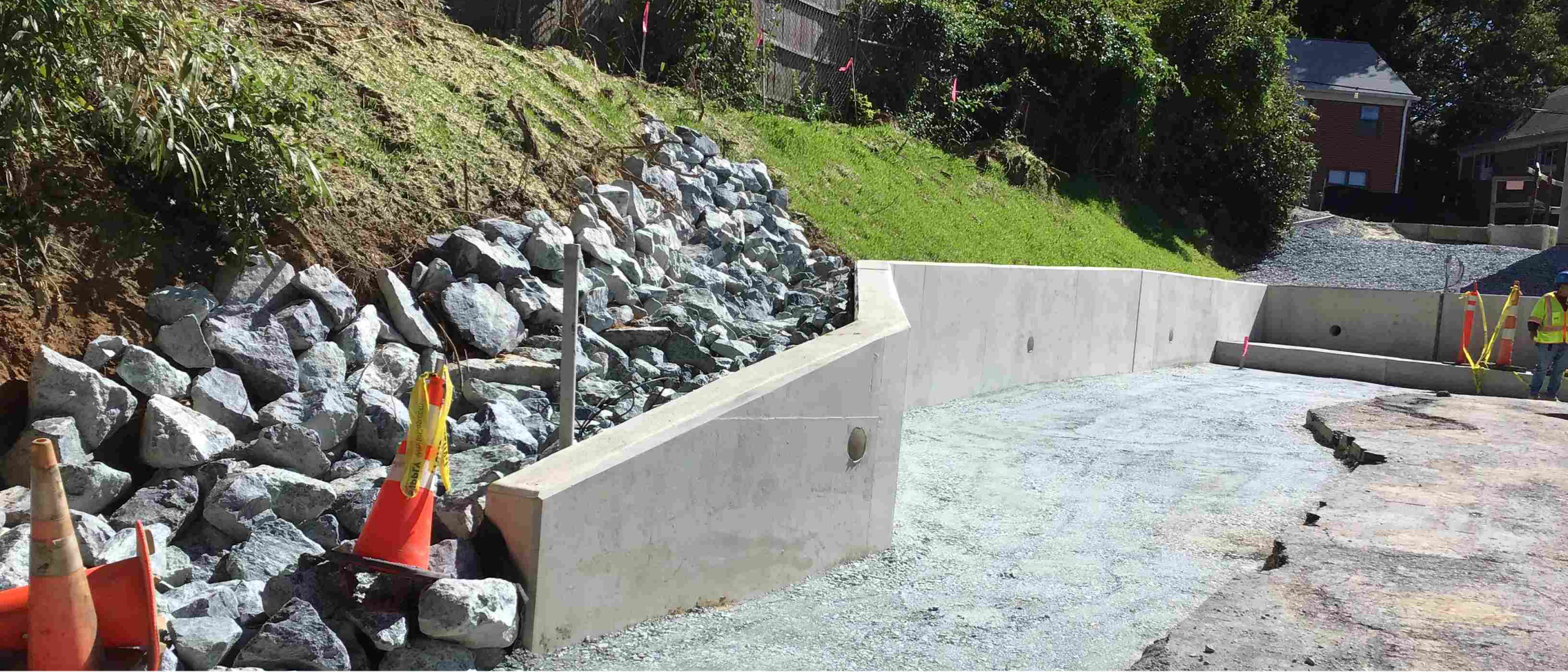
CIP Wall 3-159A Backfill – Manchester Place Station