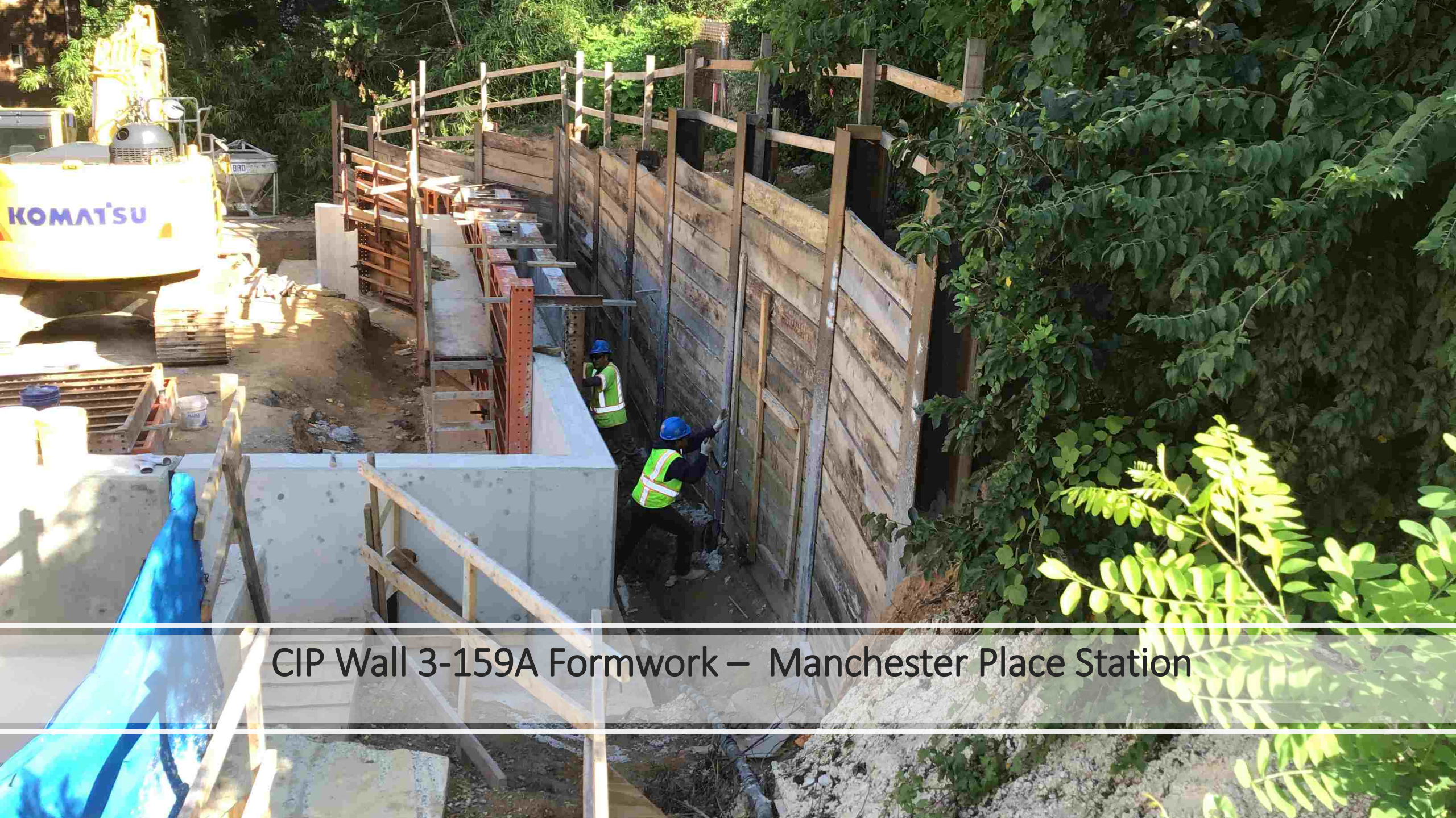
CIP Wall 3-159A Formwork — Manchester Place Station