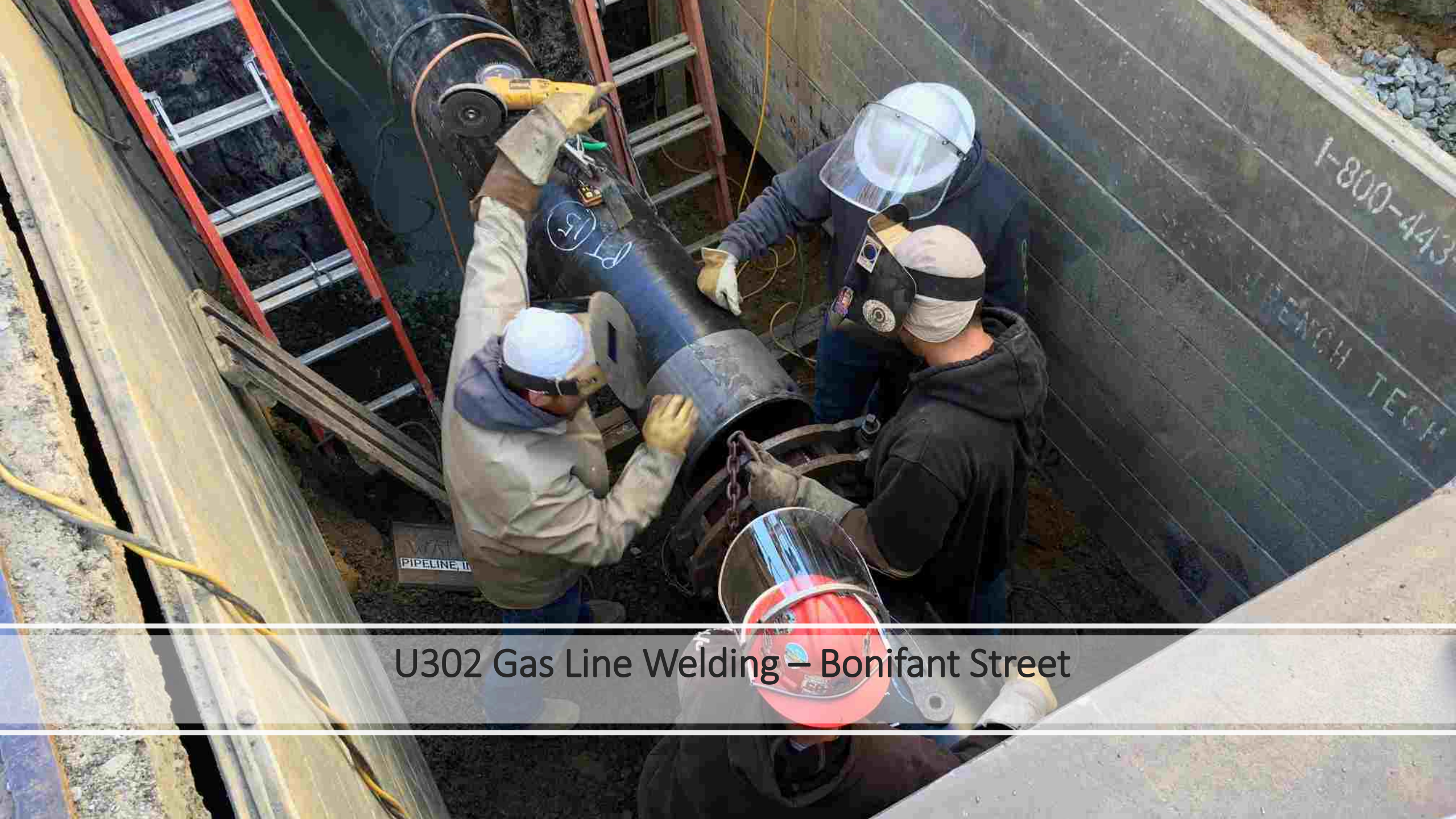
U302 Gas Line Welding – Bonifant Street