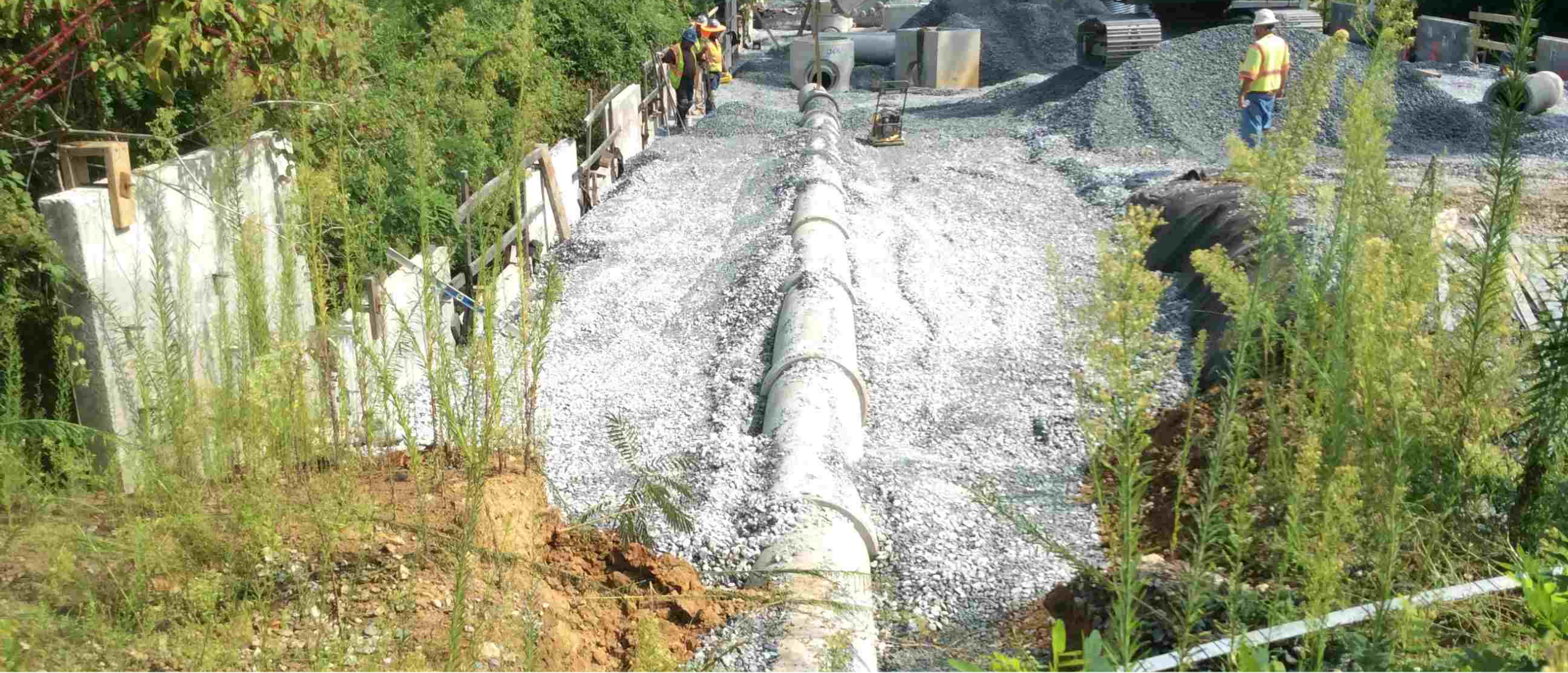
Storm Drain Installation at MSE Walls 1-023 and 1-024 – GBT at Sleaford Road