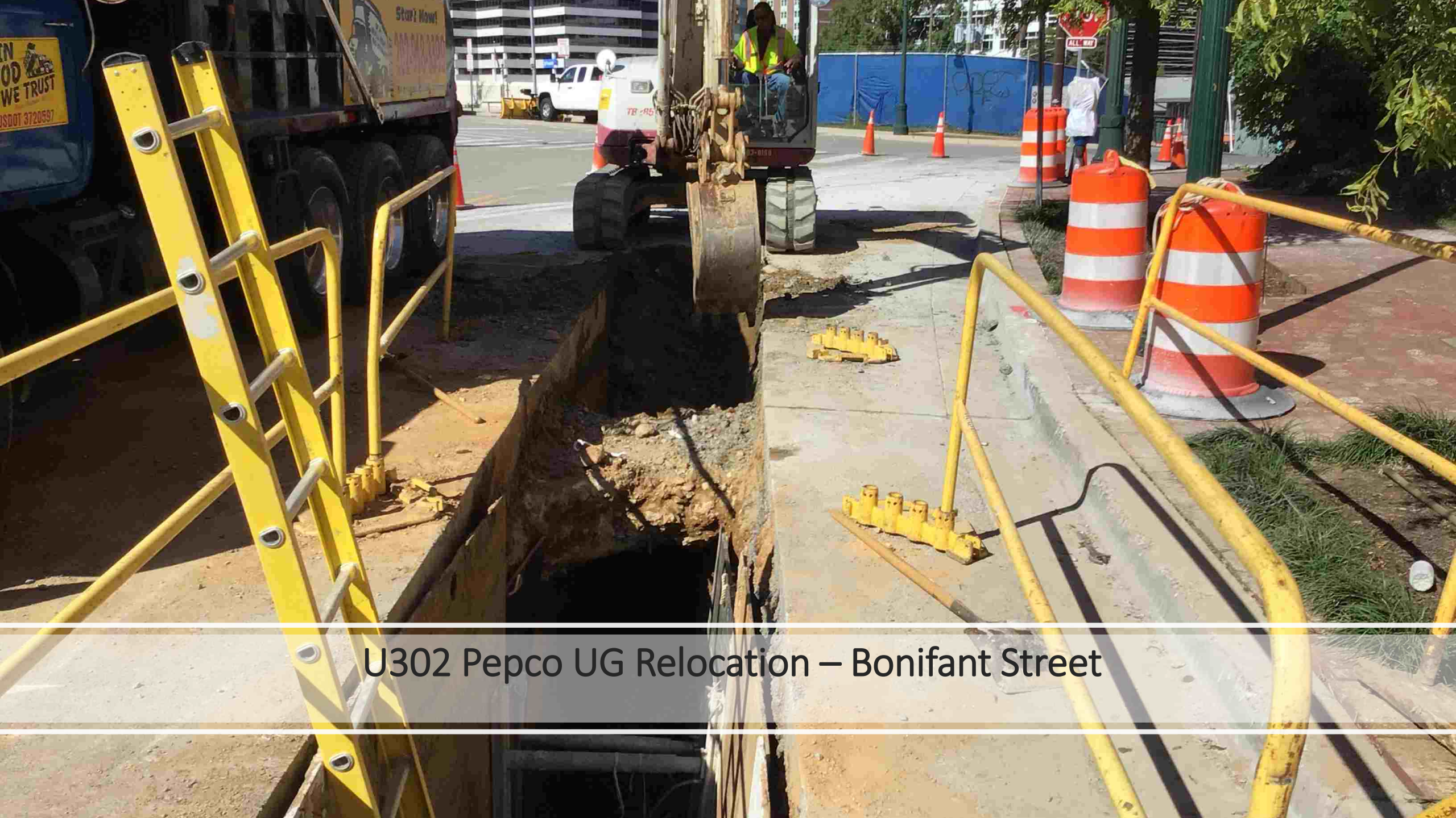
U302 Pepco UG Relocation – Bonifant Street