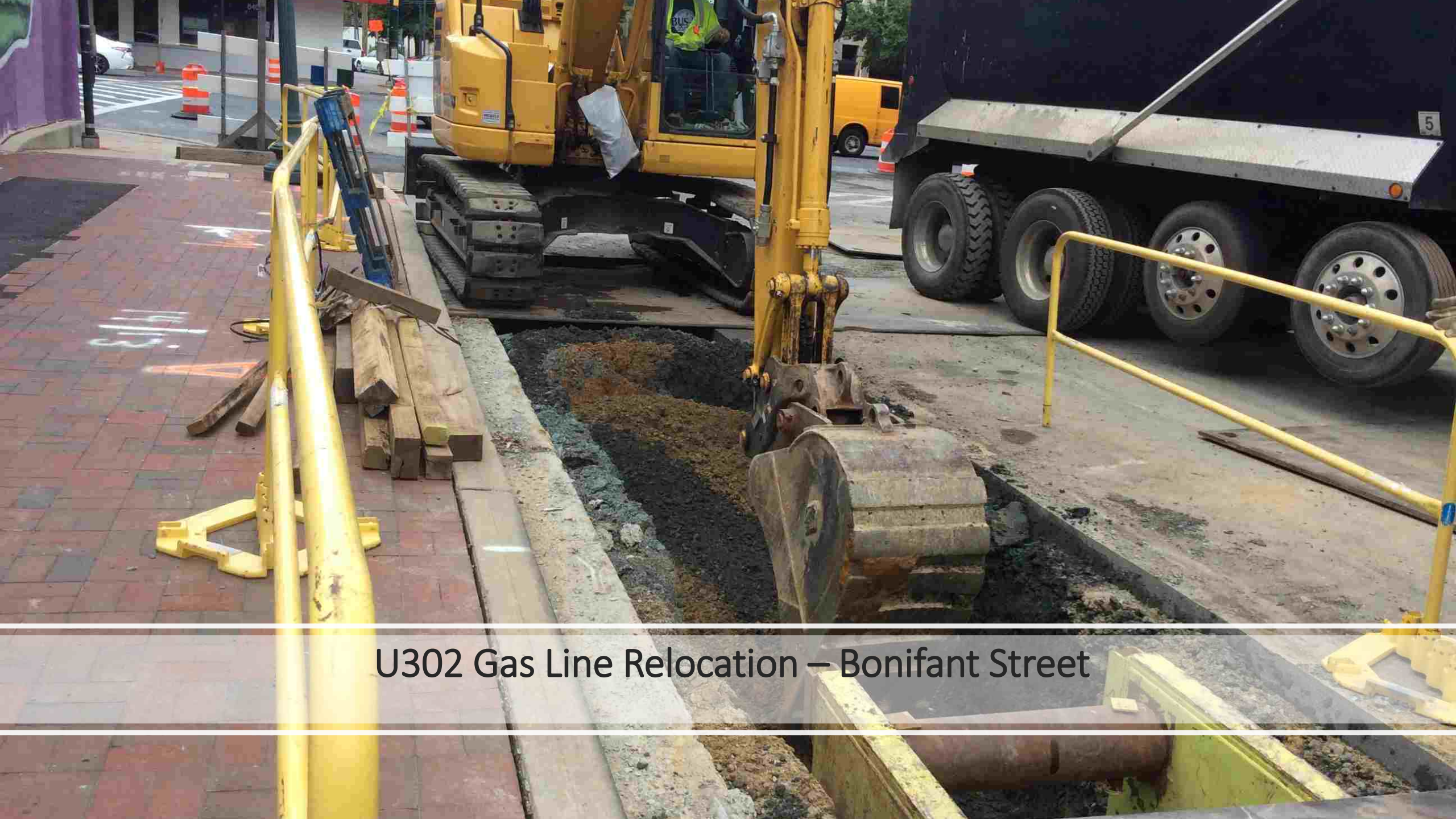
U302 Gas Line Relocation – Bonifant Street