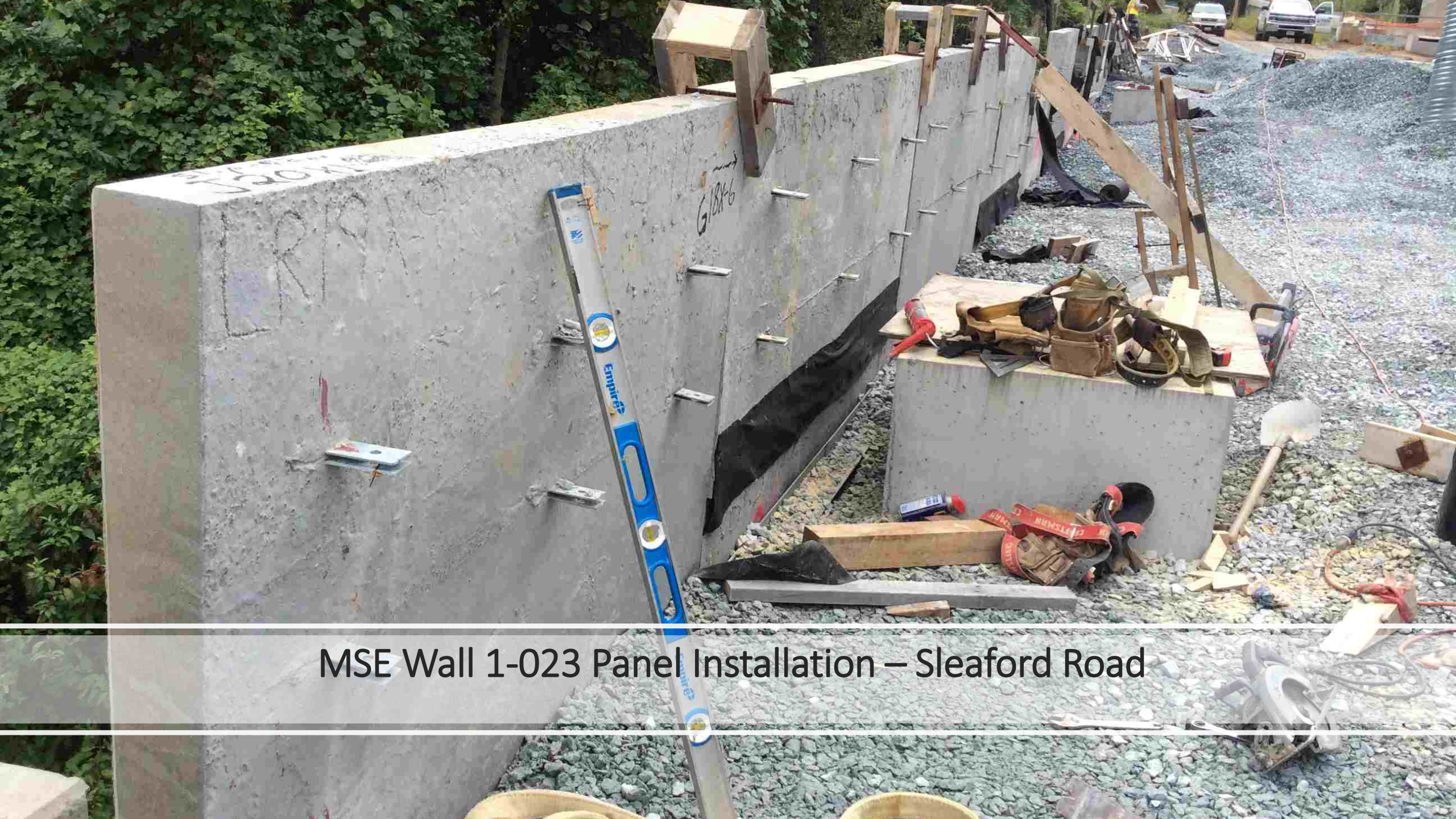
MSE Wall 1-023 Panel Installation – Sleaford Road