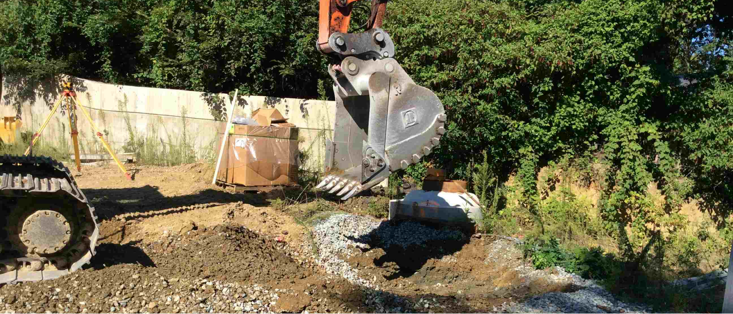
Storm Drain Installation – Sleaford Road