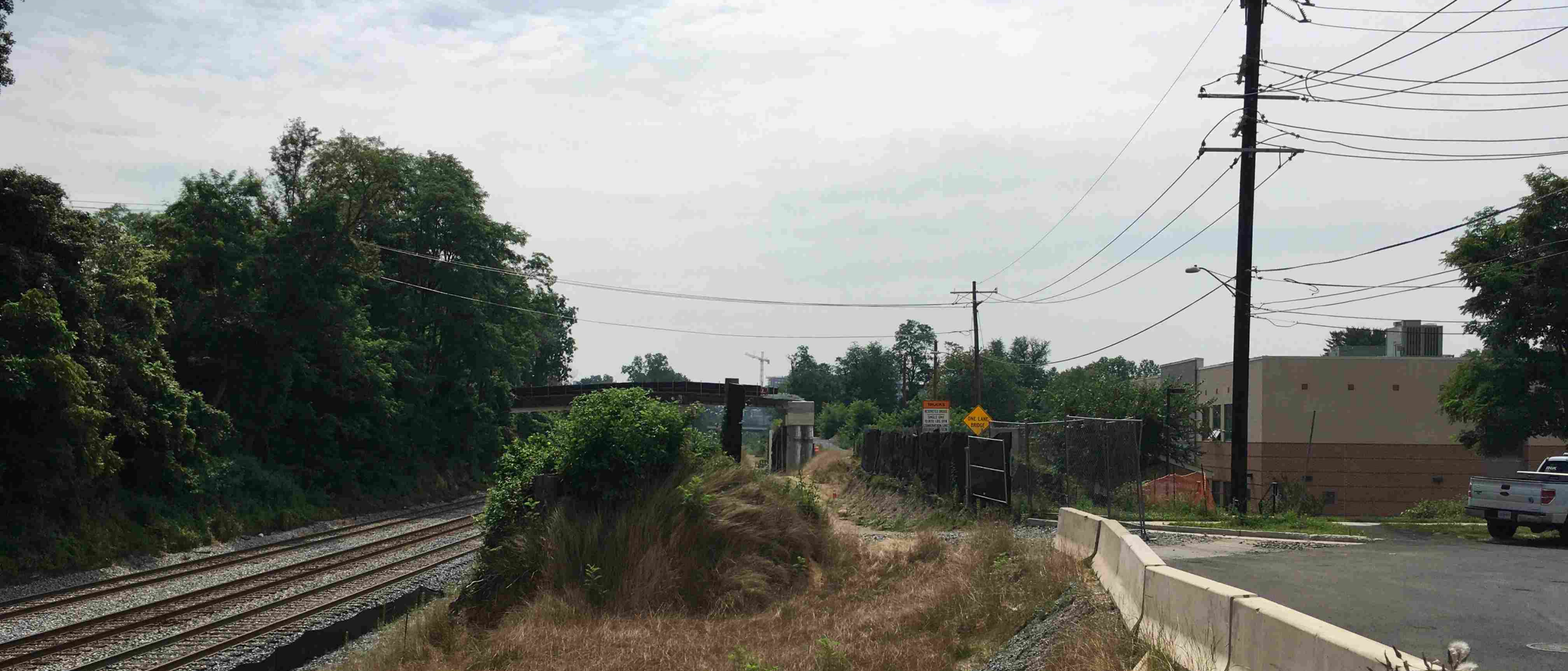
U105 Pepco Relocation – Talbot Avenue