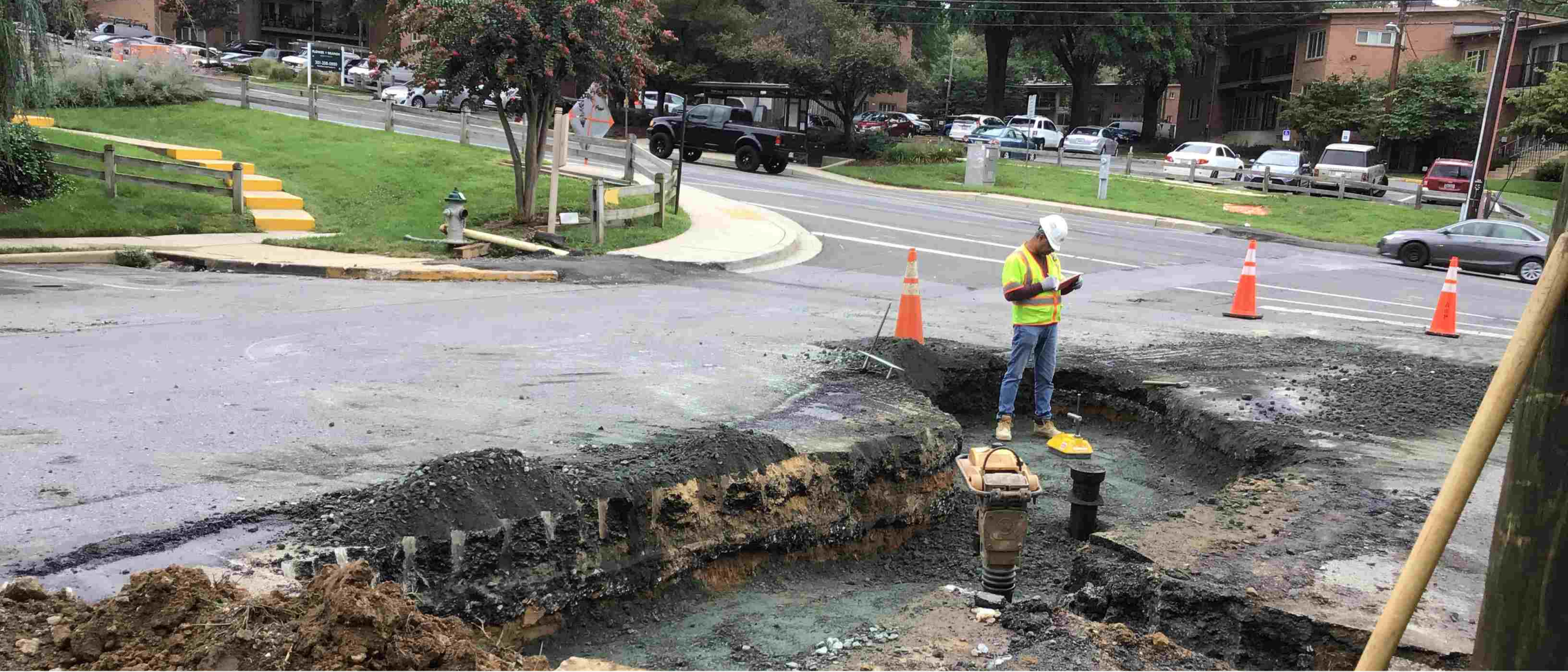
U402 Water Relocation – Piney Branch Road