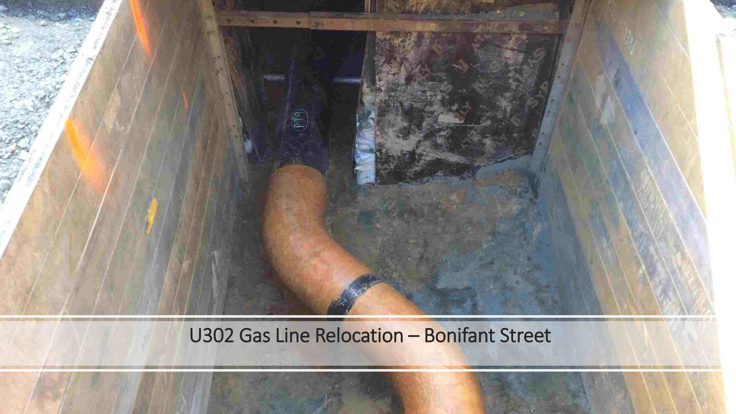
U302 Gas Line Relocation – Bonifant Street