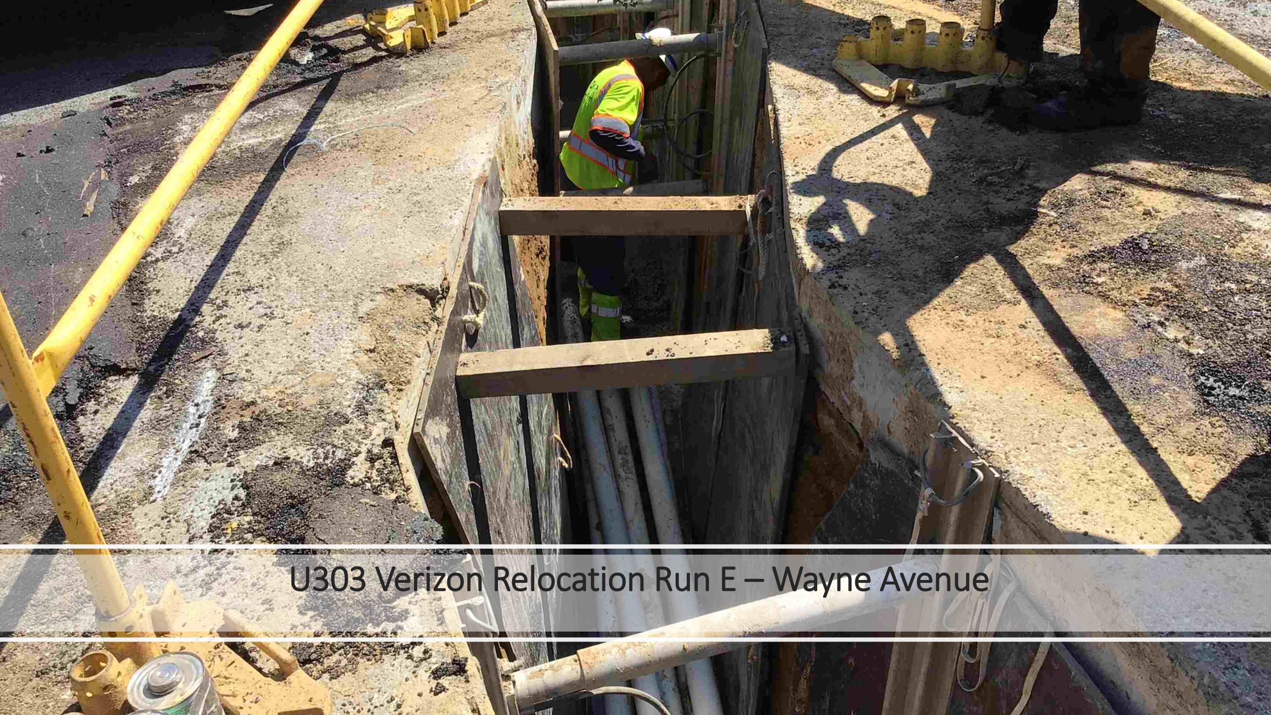
U303 Verizon Relocation Run E – Wayne Avenue