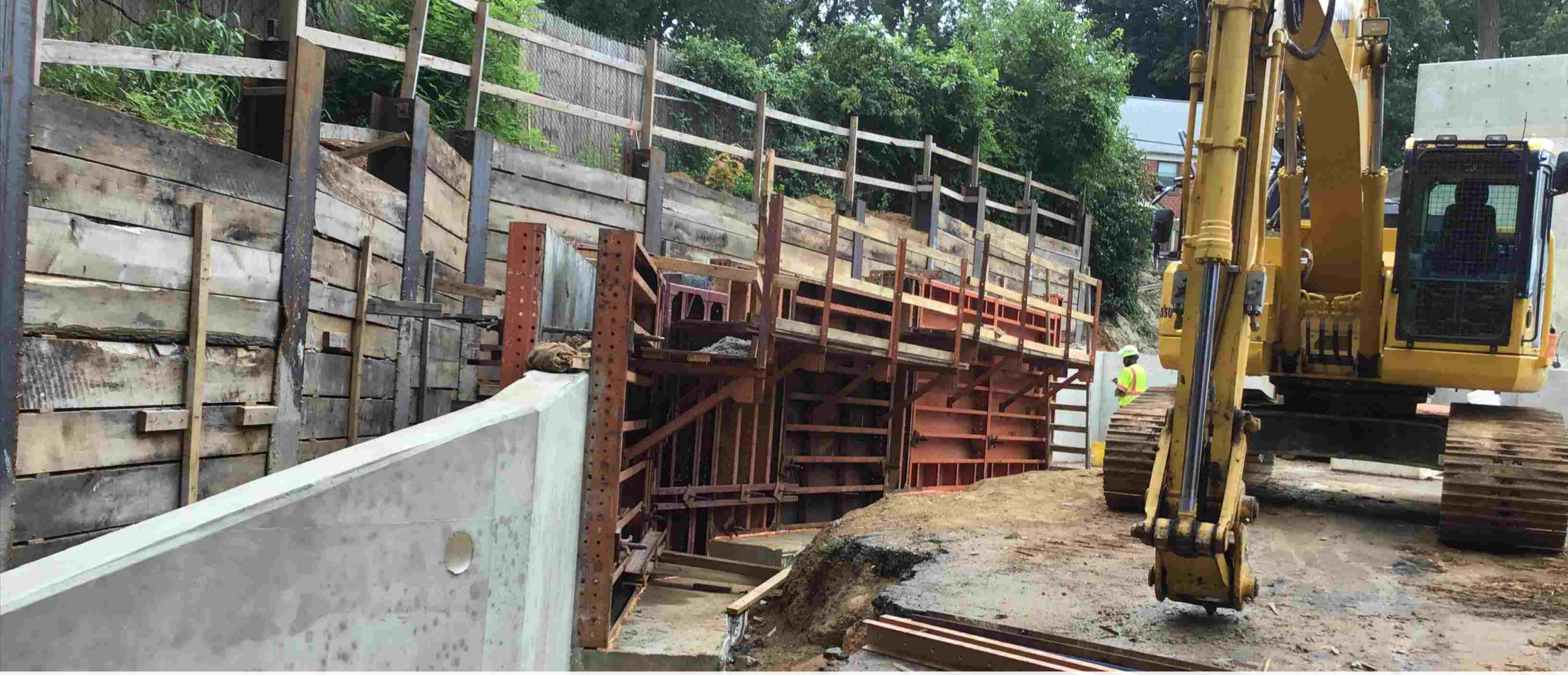
CIP Wall 3-159A Formwork — Manchester Place Station