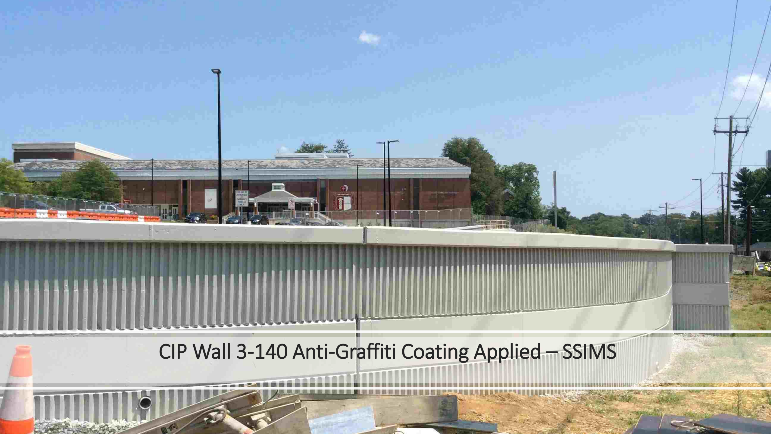
CIP Wall 3-140 Anti-Graffiti Coating Applied – SSIMS