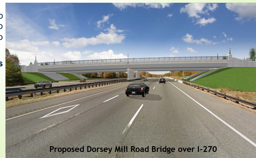
Proposed Dorsey Mill Road Bridge over I-270