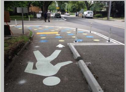
Top: speed hump. Second from top: bump-out Third from top: mini roundabout Bottom: walking lane

To sign up for the project update mailing list, please send an email to Matt.Johnson@MontgomeryCountyMD.gov and indicate you're interested in the Fenton Village projects mailing list.