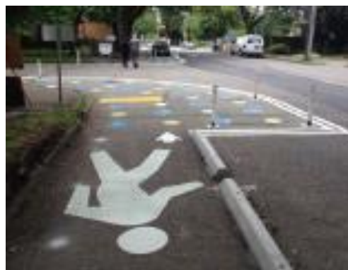
Row 2, left image: mini roundabout. Right image: walking lane.

(End of What is a Neighborhood Greenway sidebar).