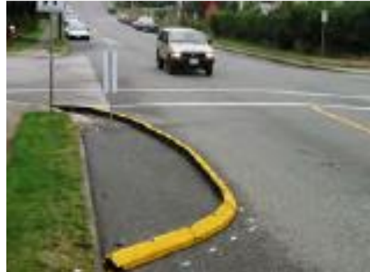
Row 1, left image: Speed hump. Right image: bump-out.