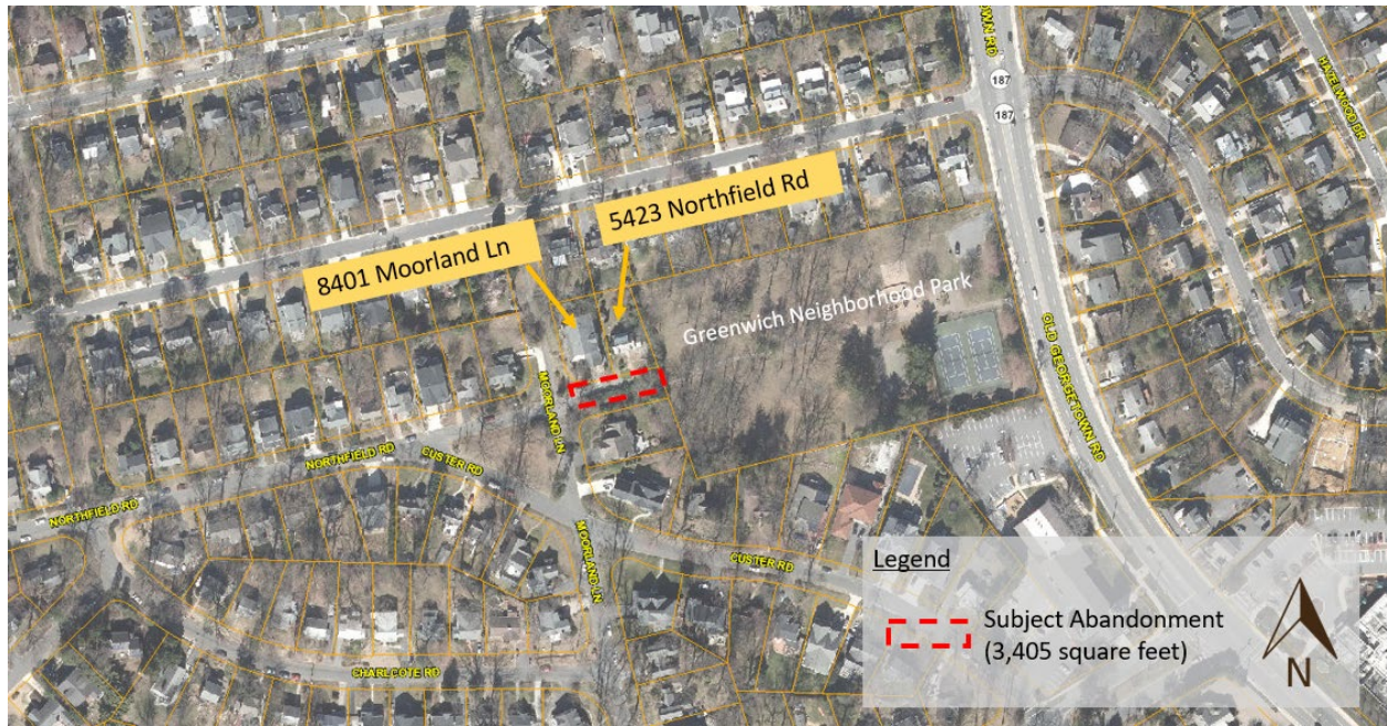
Figure 1 – Vicinity Map

Northfield Road is a Residential Street that runs from Huntington Parkway on the west and terminates at Greenwich Neighborhood Park to the east in Bethesda. The Subject Abandonment pertains to the northern half of the easternmost block, between Moorland Lane and Greenwich Neighborhood Park. The right-of-way is subject to the 1990 Bethesda/Chevy Chase Master Plan , the 2018 Master Plan of Highways and Transitways , and Chapter 49 of the County Code (“Road Code”).