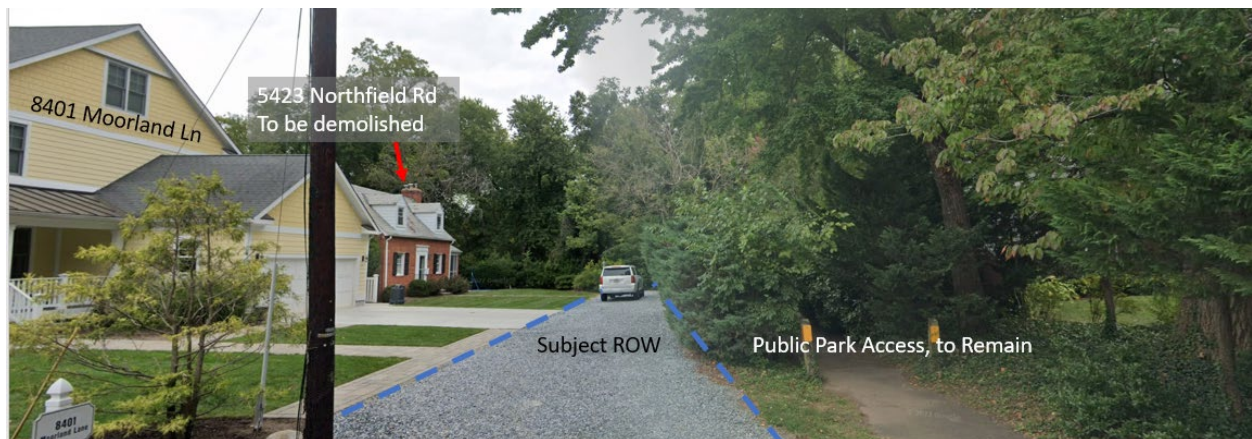
Figure 4 – View of Subject Abandonment, closer view (Northfield Road looking east)

It is important to note that Northfield Road has never been platted to extend beyond (or through) Greenwich Neighborhood Park, and it is not master planned to do so in the future. The 1990 Bethesda Chevy Chase Master Plan and the 2018 Master Plan of Highways and Transitways both envision the eastern terminus of the roadway at the western boundary of the Greenwich Neighborhood Park, as it exists today.