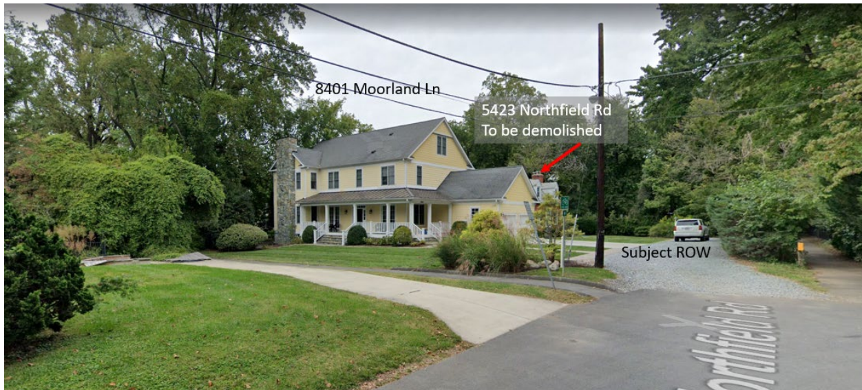
Figure 3 – View of Subject Abandonment (Northfield Road looking east)