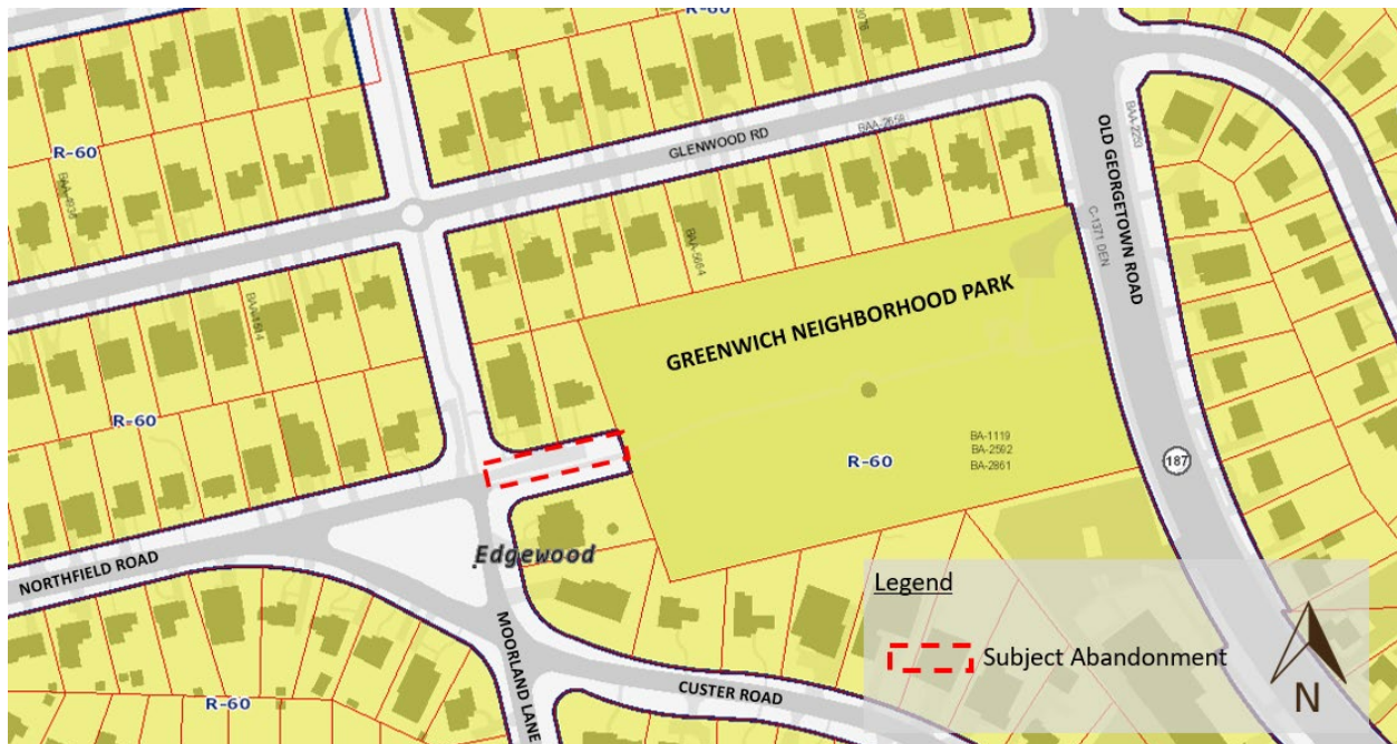
Figure 2 – Zoning Map

Both properties are accessed from Northfield Road. As evidenced by the site photos, the Northfield Road right-of-way is comprised of a gravel roadway located along the northern half of the right-of-way which provides access only to the Applicant’s properties and a paved pedestrian path located on the southern portion of the right-of-way providing a link to Greenwich Neighborhood Park.