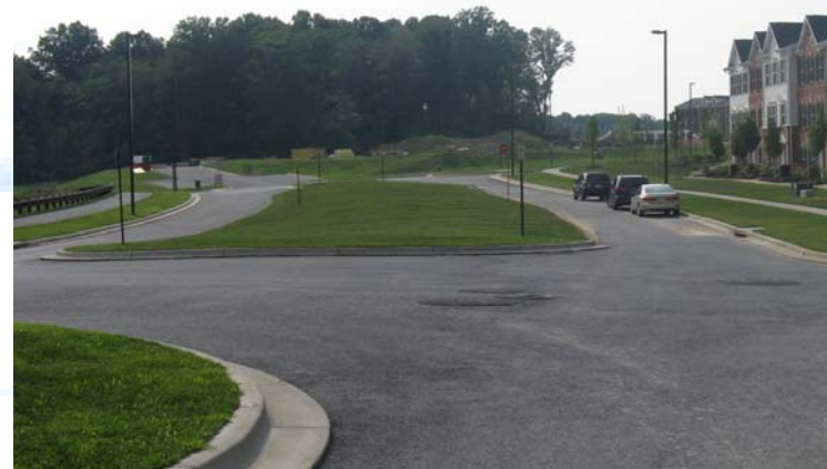
Existing Roberts Tavern Drive between Latrobe Lane and Observation Drive.

Specifically, Roberts Tavern Drive Extended will provide a vehicular, bicycle, and pedestrian connection between MD 355 and Observation Drive, improve transportation network efficiency, and relieve future congestion on MD 355. Ultimately, with the planned relocation of MD 355, extending Roberts Tavern Drive to MD 355 would also divert regional through traffic around the Clarksburg Town Center and historic district.