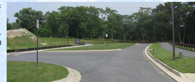
The existing terminus of Roberts Tavern Drive, which is being evaluated to be extended under the Roberts Tavern Drive/MD 355 Bypass planning study.

Fifteen public comments were received after the November 2009 public meeting. The Majority of the comments were in support of the project and its dual bikeway feature. Comments included enhancing safe bicyclist and pedestrian crossings; installing traffic signal at the proposed intersection; permitting northbound left turns from Roberts Tavern Drive to MD 355; and maintaining driveway access onto MD 355.