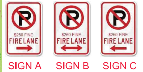
SIGN A SIGN B SIGN C