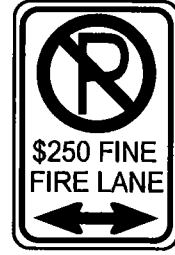
FIRE LANE NO PARKING SIGN DETAILS