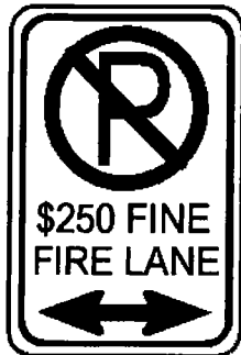
FIRE LANE NO PARKING SIGN DETAILS