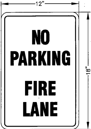
PROPOSED SIGNAGE (NOT TO SCALE)