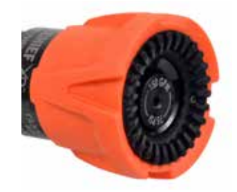
Fixed Molded Urethane