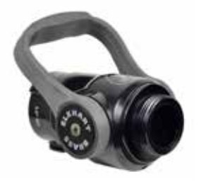
1.5" XD Shutoff

2.5" Shutoff Free Swivel Base / Pistol Grip