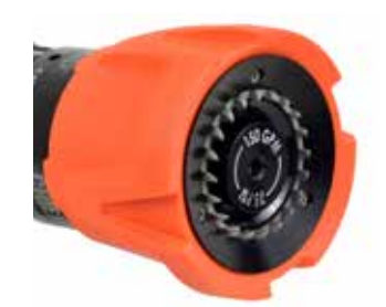
Spinning Stainless Steel (Standard)

Choose from spinning stainless steel metal or fixed molded urethane teeth.