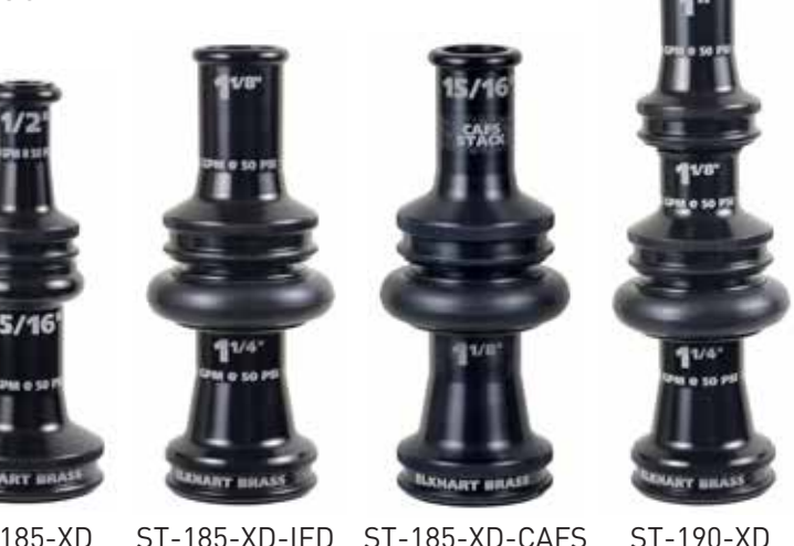
ST-185-XD ST-185-XD-IFD ST-185-XD-CAFS