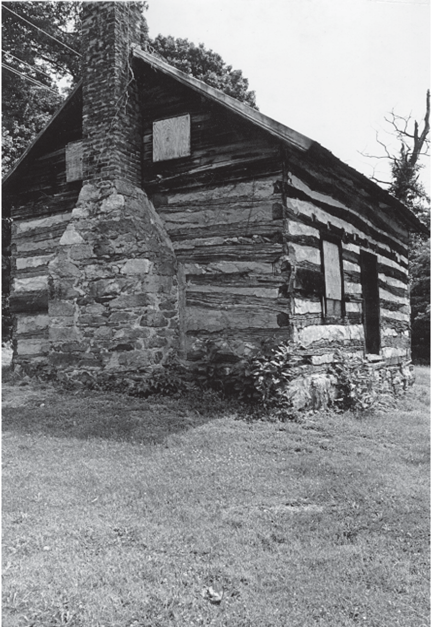
Oakley Cabin, Brookeville Many early homes were log cabins chinked with clay and water.