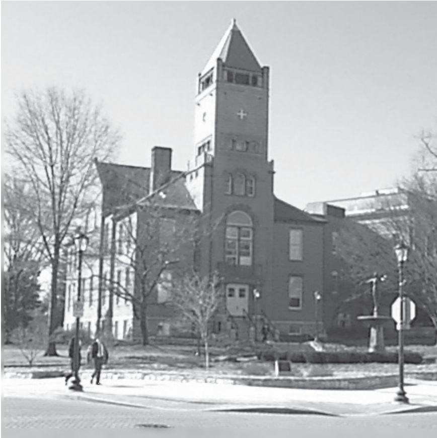
Red Brick Courthouse, Rockville, Maryland.