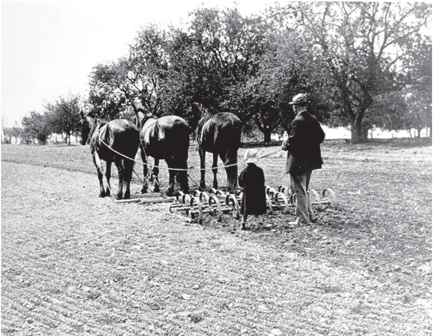
Preparing ground for wheat on the Snyder farm in Travilah.

During the 19th century, horses were the principal means of transportation. Of immense commercial importance was the development of the Chesapeake and Ohio (C&O) Canal, which would eventually stretch 184 miles between Washington and Cumberland. Begun in 1828, the project was not completed until 1850. The cost was approximately $11 million. The locks, which could lift or lower a boat about eight feet, were considered engineering marvels in their day. A canal museum has been established in the National Park at Great Falls. It includes a restored lock and many canal artifacts displayed in a former stone tavern.