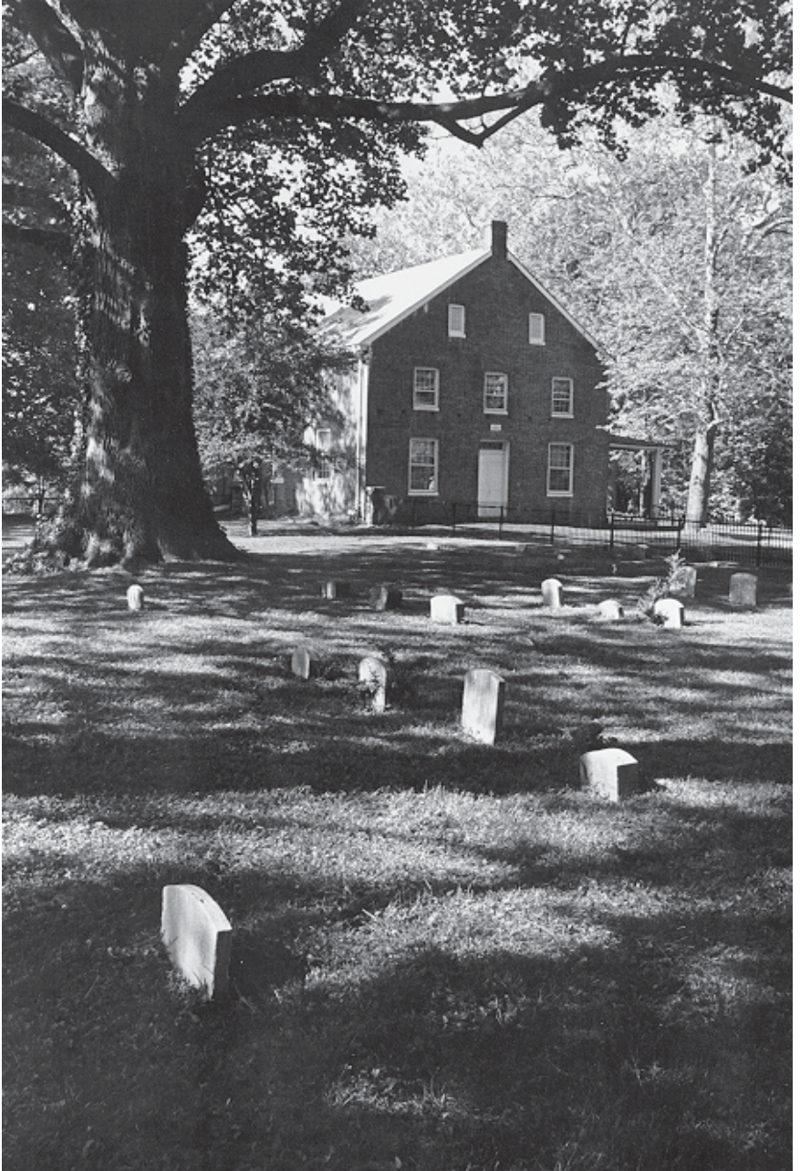
Friends Meeting House at Sandy Spring.