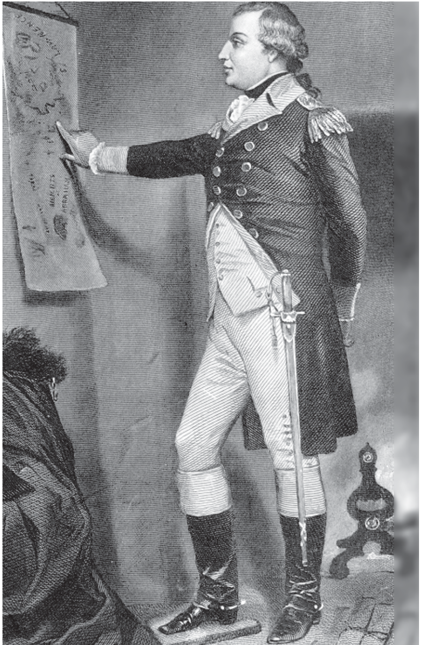
General Richard Montgomery