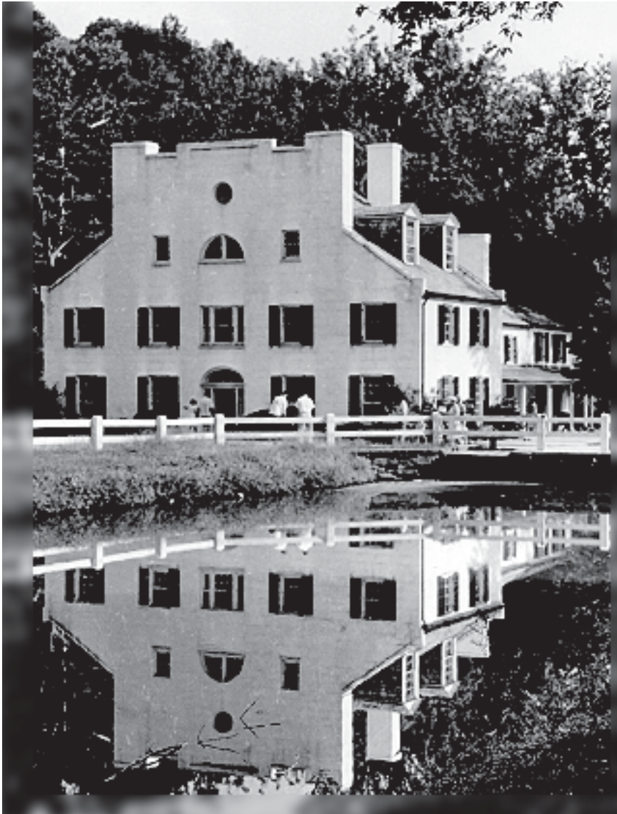
Great Falls Tavern on the C&O Canal now serves as a visitor's center.