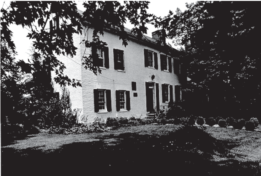
The Madison House in Brookeville.

In December 1791, the Maryland General Assembly passed an act ceding 36 square miles of Montgomery County to the federal government to be used as the nation's capital. As a result, the District of Columbia was born and Montgomery County lost Georgetown, its port city. Virginia also ceded land for the federal city, but this land was later returned to the state and is now Arlington County.