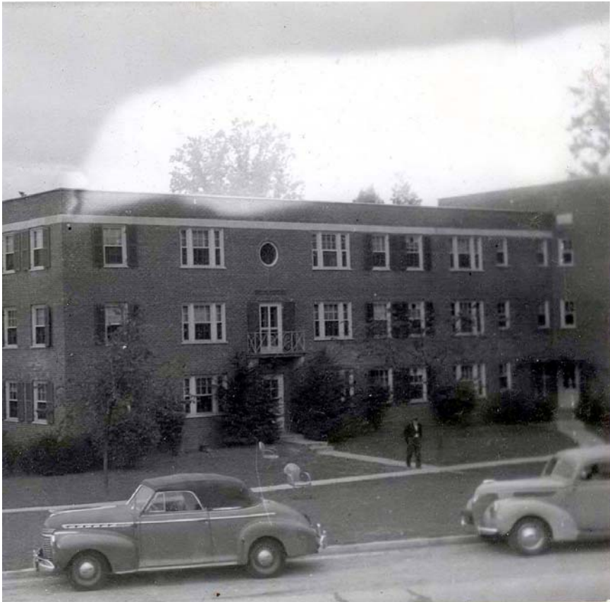
Falkland Apartments in Silver Spring

advocates was recognized when Montgomery County was the first county in the nation to be honored as an “All America” municipality. Previously only cities had received the award.