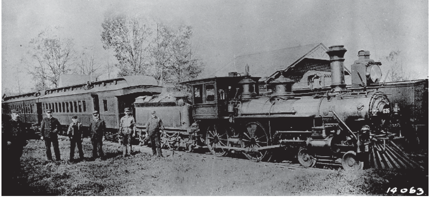
Gaithersburg train station in 1890.

Throughout the war, both sides sometimes plundered the countryside, stealing horses and food. Much of the wooden fencing in the County reportedly found its way into army campfires. A prominent County resident, Montgomery Blair, served as Lincoln's postmaster general during the War Between the States.