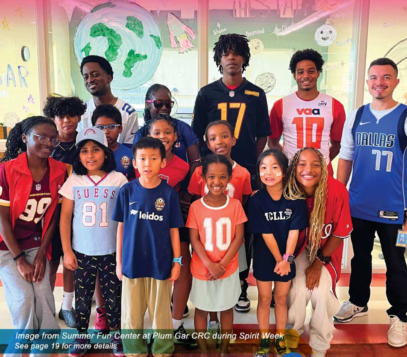
Image from Summer Fun Center at Plum Gar CRC during Spirit Week See page 19 for more details