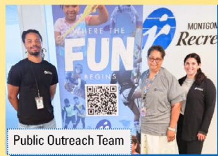
Public Outreach Team