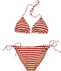
2 piece Bathing Suit