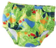
Plastic Pant or Rubber Diaper