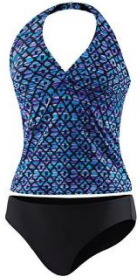
2 piece Tankini