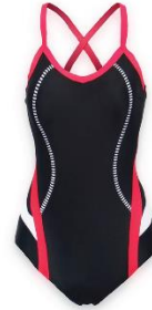
1 piece Bathing Suit