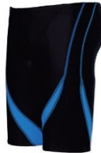
Long Swim Briefs