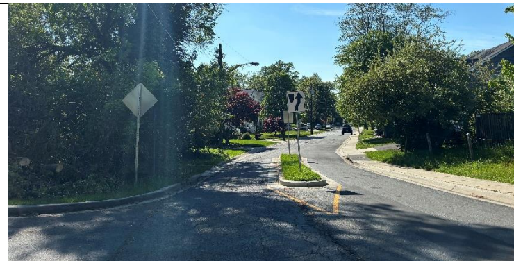
Construction underway for Upton Drive Neighborhood Greenway with installation of lane splits to narrow the roadway.