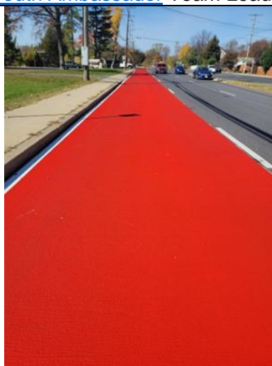
Red paint installed for dedicated bus lane on University Blvd W.