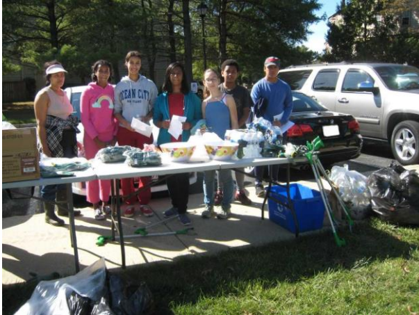
Department of Environmental Protection Cleanup 2017

The Montgomery County government launched an Employee Giving Campaign beginning in October 2017. In conjunction with the Campaign, county departments participated in Community Service Week as a part of their giving efforts. Giving initiatives ranged from projects directly benefiting county programs, inter-departmental collection drives and participation in Community Service Week projects.