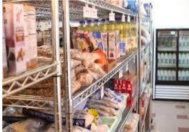
Manna Foods – Food Drive Office of Agriculture