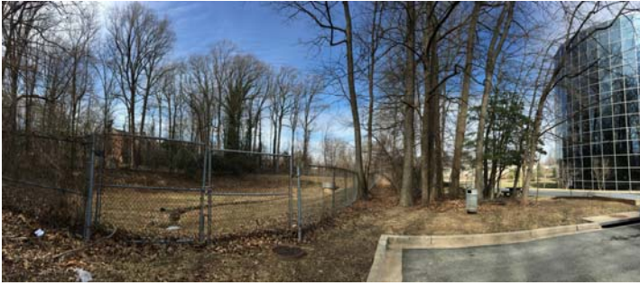
Photo 2 - Existing dry pond with construction access area shown at southeast corner of pond.

The existing dry pond provides no water quality treatment to stormwater flowing into Cabin John Creek. The pond collects stormwater runoff from 29 acres. 44% of this area is impervious surfaces such as rooftops, driveways, and parking lots.