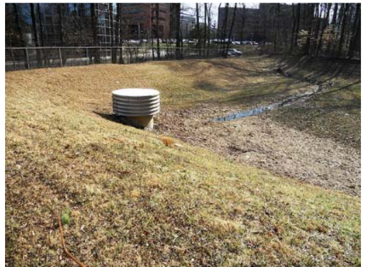
Photo 1 - The existing dry pond within the Kaiser Permanente office complex.

The Montgomery County Municipal Separate Storm Sewer (MS4) permit requires Montgomery County to add new stormwater management and retrofit existing stormwater management facilities around Montgomery County. The project design, permitting, and construction will be performed by Montgomery County Department of Environmental Protection (DEP).