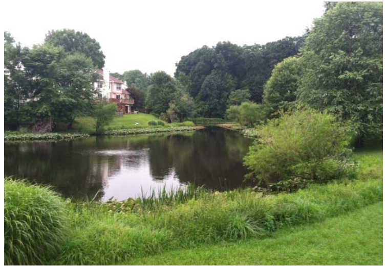
Photo 3 - Example of wet pond with aquatic vegetation buffer between water's edge and adjacent land