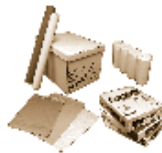
Office Paper and Supplies

There are plenty of recycled paper products you can purchase to help close the recycling loop. Many local grocery, office supply and hardware stores sell recycled paper products such as envelopes, computer paper, tablets, etc. Also, building materials such as counter tops can be made with recycled paper as well.