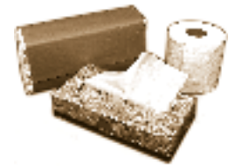
Paper Towels, Tissues and Toilet Paper